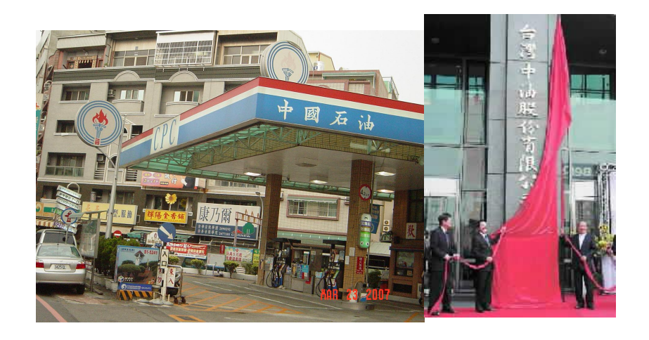
Before After Figure 4. China Petroleum Company Changes Name to CPC, Taiwan

Another case in which Taiwan is going through a name change trend is with its license plate identification. This case in particular has received less attention from the media. However it is intriguing all the same. Perhaps the reason behind less media attention is because instead of changing the name from China to Taiwan or adding the name Taiwan, in this incident the name is simply removed. When Chiang Kai-shek established his government on Taiwan, it was intended only to be temporary. At least in the psychological sense, to preserve the ROC as the legitimate government of all of China, Chiang established the capital in Taipei and dubbed Taiwan a "province" of China. Along with having Taiwan as a province a position was created to govern the province. <sup>18</sup>