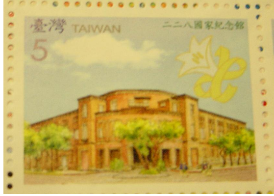
Figure 3. 2:28 Stamp Bears the Name "Taiwan" (Shown on the right.)

Other companies which bore the word "China" in their name have been going through or considering the name change process. On the same day as Chunghwa Post's name change, China Petroleum Company, CPC (中国石油), formerly owned by the ROC Government, changed their to CPC, Taiwan (台灣中油)<sup>16</sup> This was so that people confuse the company with mainland. CPC's original name the word chungguo (中國) in it, which by most people is interpreted to be mainland China. The new name still bares the character chung (中) in its name but that is because some other company already had the name Taiwan Oil (台灣石油). <sup>17</sup>