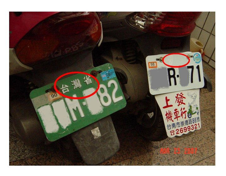
Figure 5. License Plate Name Removal

stopped producing plates with the words " Taiwan shen ." Instead the plates are being produced with no name at all only the license number, see figure five. <sup>19</sup> In doing so it may also gradually erase impressions that Taiwan is part of China.