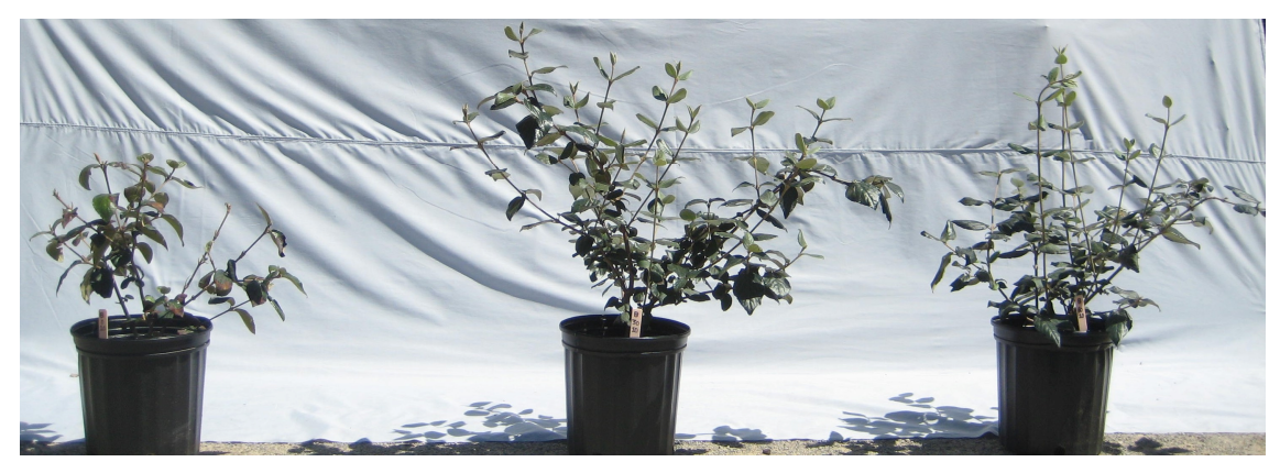
Figure 3.1. Burkwood viburnum leaf necrosis in August at 0%, 30% and 60% shade (from left to right).