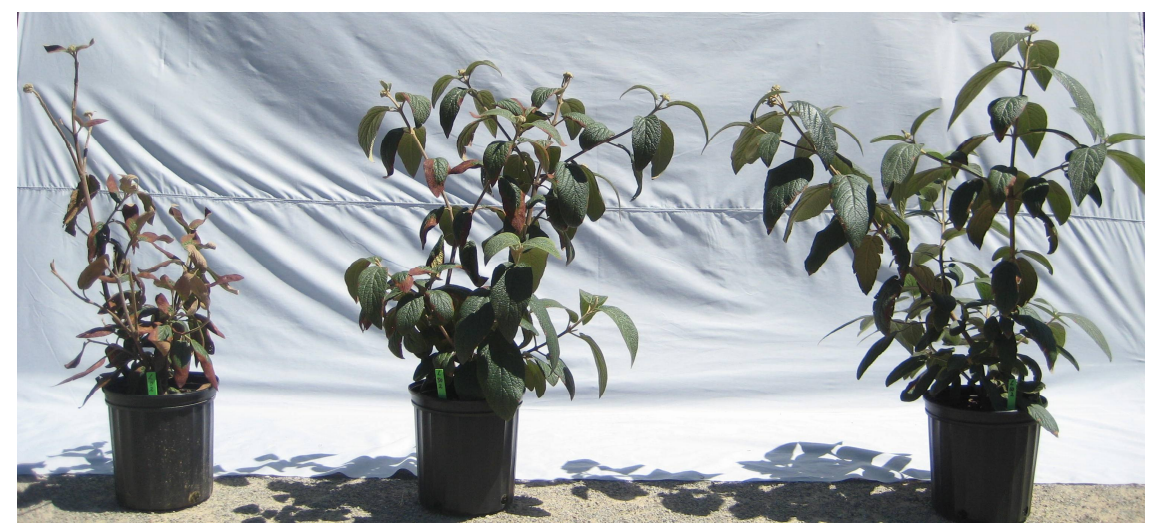
Figure 3.3. Leatherleaf viburnum leaf necrosis in August at 0%, 30% and 60% shade (from left to right).