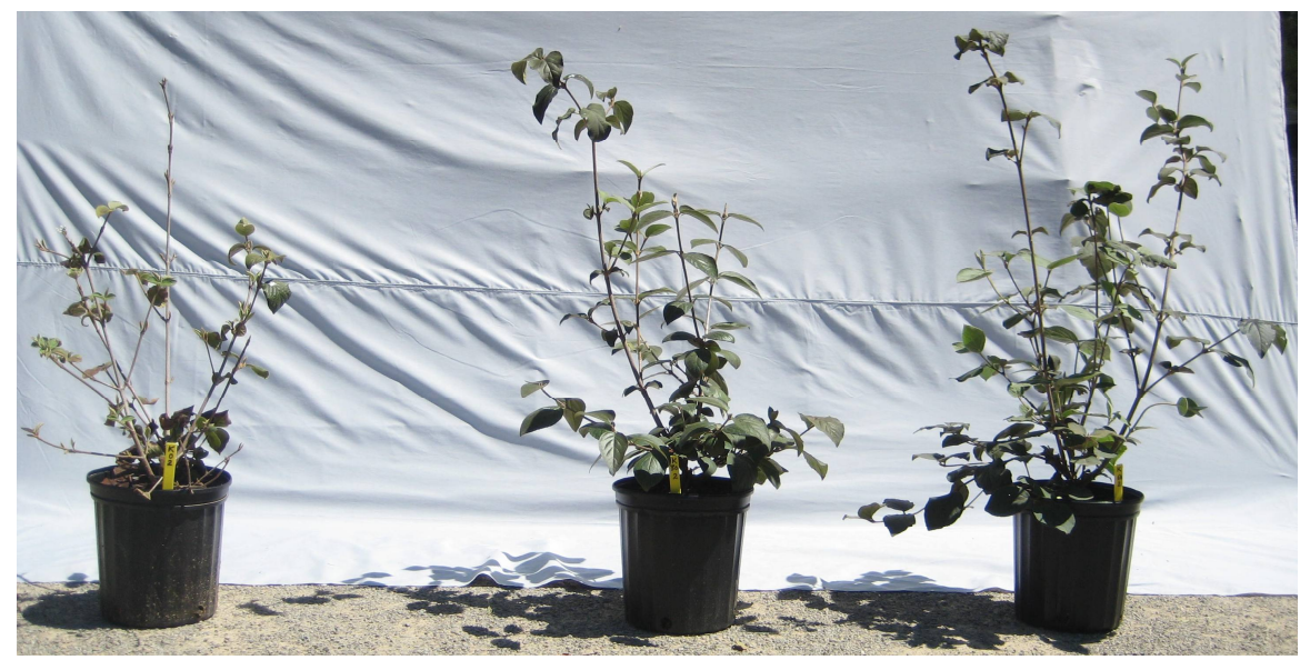
Figure 3.2. Korean spice viburnum leaf necrosis in August at 0%, 30% and 60% shade (from left to right).