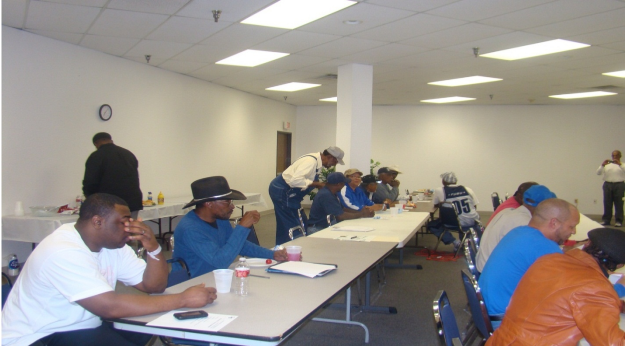
Figure 5. Vote for Officers to the OMTC Group