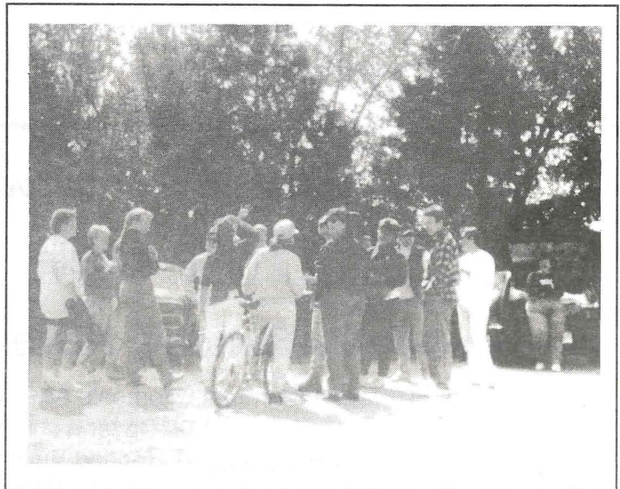
All packed up but not ready to go!

Don't miss the fun -- Mark your calendar now and plan to attend the Herland Spring Retreat May 21 - 23, 1993.