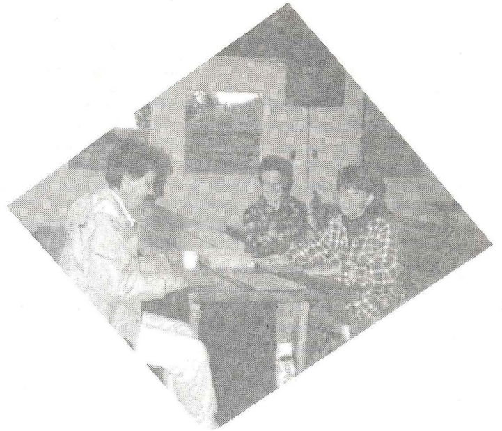
Preparing a mailing for the legal defense fund.