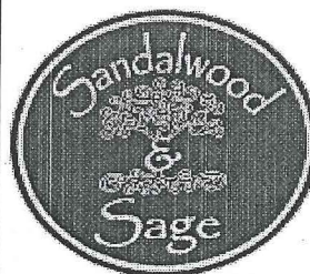
Sandalwood & Sage

Each office is independently owned and operated.