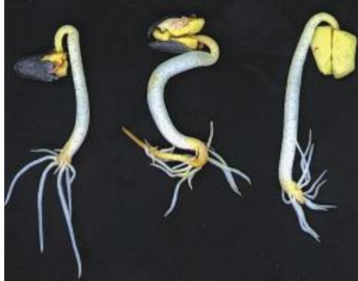
Cotton seedlings exhibiting chilling injury

The two seedlings below show normal root development. When the two groups are compared it may be noted that seedlings injured by chilling are often short with thickened hypocotyls and radicles, dead root tips, and show some signs of lateral root growth.