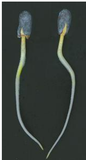
Normal cotton seedlings

The two seedlings below show normal root development. When the two groups are compared it may be noted that seedlings injured by chilling are often short with thickened hypocotyls and radicles, dead root tips, and show some signs of lateral root growth.