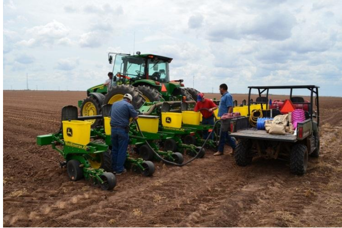
OSU Cotton Extension crew planting a large plot irrigated cotton variety trial in a cooperater field in Jackson County, May 14, 2012.