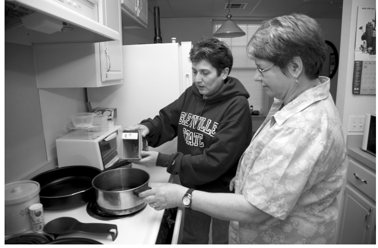
Oklahoma Cooperative Extension Service