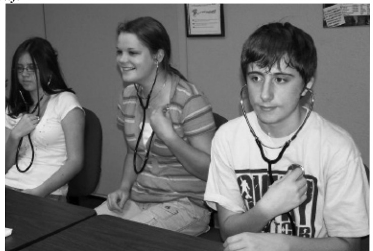
Students in Garfield County learn about nutrition and physical activity related to heart health.