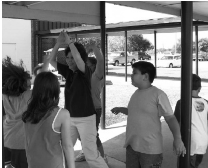
Students in Love County have fun being physically active.