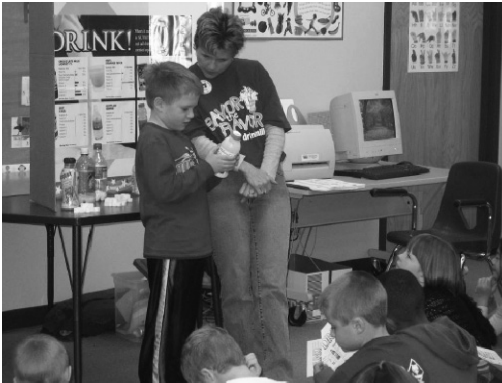
Students in Oklahoma County learn about the amount of sugar in beverages.