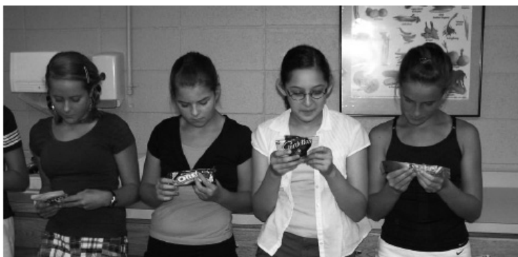
Students in Garfield County learn how to compare nutrition labels.