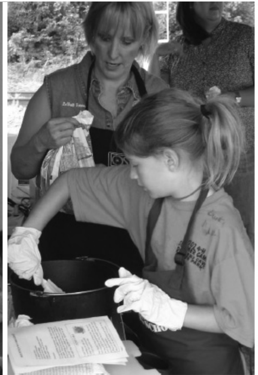
Students in Pittsburg County learn healthful ways to prepare fruits and vegetables.