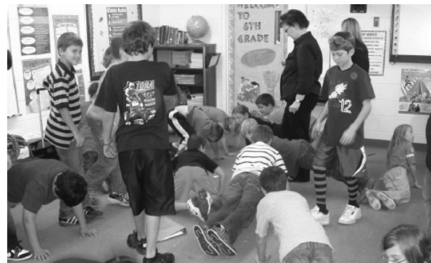
Students in Latimer County participate in physical activity.