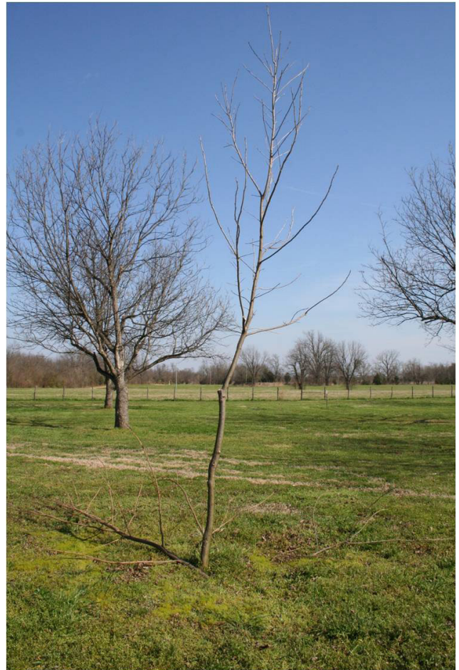
Figure 2. Pecan tree in figure 1 after pruning to a central leader. The tree consists of a straight central trunk with scaffold limbs spaced up and around the trunk.