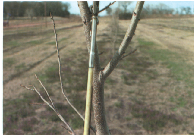
Figure 7. The side branch to the right is approaching the diameter of the trunk and should be removed. Otherwise, this tree will grow to become structurally weak, like the tree in Figure 8.