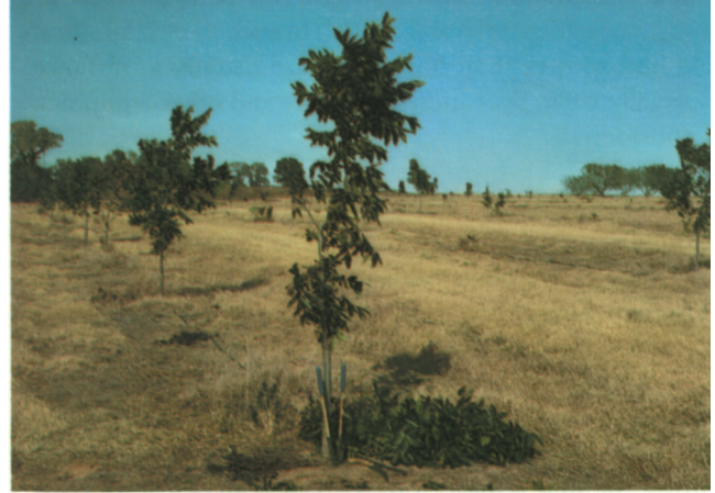
Figure 5. A 'trashy' trunk tree. Temporary growth is allowed to grow on the central leader (trunk) below the height of the first scaffold limb during the first three or four years. This 'trashy' temporary growth is restricted to 6 to 10 inches by pinching. Each shoot is removed in lieu of new growth when the shoot exceeds 1 inch in diameter.