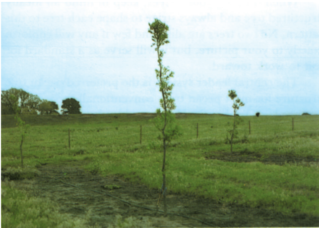
Figure 6. One-third of this vigorously growing central leader was removed during the first growing season, which can encourage more uniform bud break along the leader.