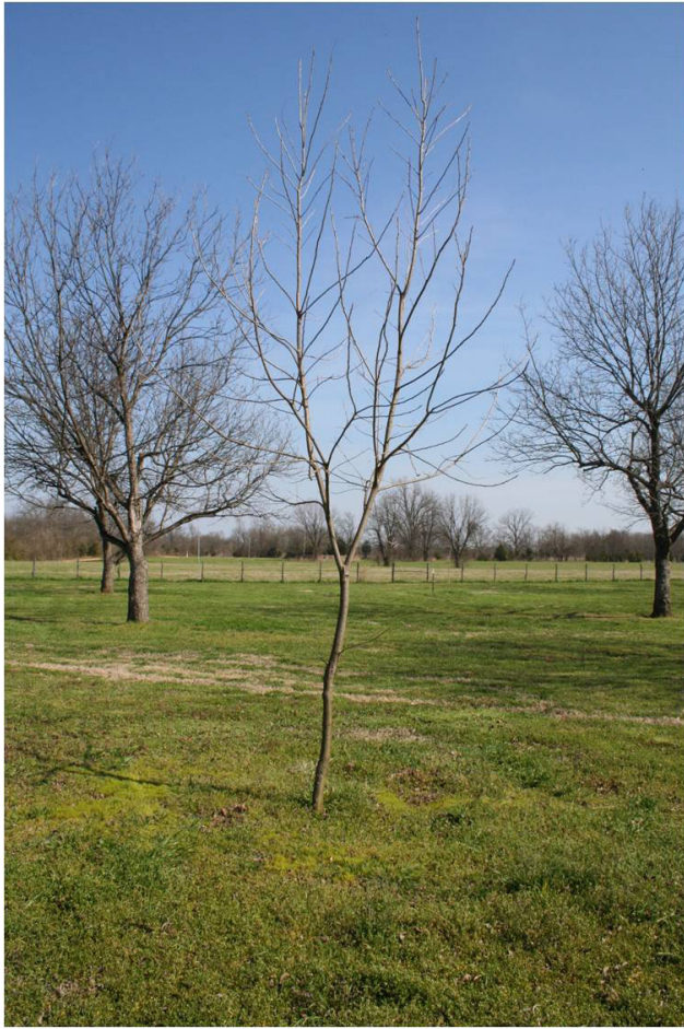
Figure 1. Pecan tree with a trunk terminating into 2 branches (leaders), weakening the tree structurally. This tree is susceptible to splitting and destruction of the entire tree.