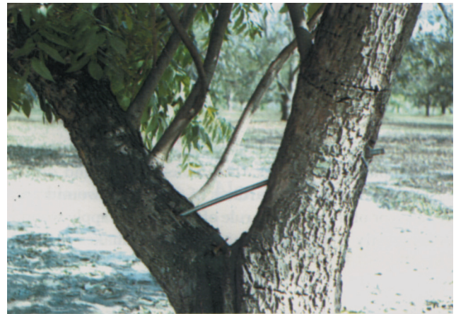
Figure 8. This weak crotch subjects the tree to total destruction by splitting the trunk to the ground. One limb (preferably the one on the left) should have been removed during the early training years of the tree's life. Use of the threaded rod for support is questionable.