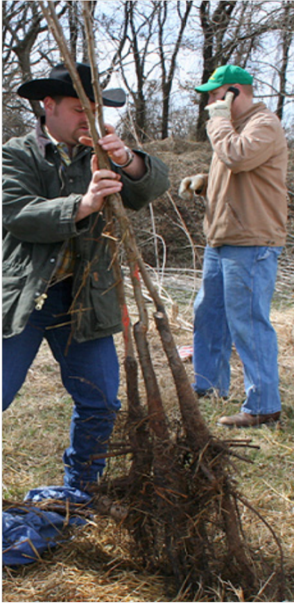
Figure 4. Vigorous, healthy dug trees ready for planting. These are approaching 8 feet in height. Most field grown bareroot trees of this grade are a 3 year-old root system and a 1 year-old grafted or budded top.