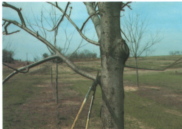
Figure 9. This branch is being removed while leaving the protective branch collar intact with the trunk.

This protective barrier inhibits tree-inhabiting microorganisms from entering the wood above or below the branch