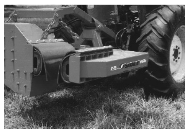
Figure 2. A Pecan Shaker Equipped with Donut Pads.

Nut thinning can be accomplished with a conventional tree shaker equipped with donut pads (Figure 2). Donut pads are essential in preventing injury to the tree trunk. As an additional precaution, apply a coating of grease between the rubber flap and the donut pad. This allows movement at that point and prevents movement of the bark during tree shaking.