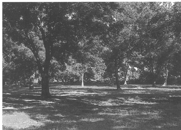
Figure 1. A grove that has been very productive for several years. The amount of shade on the ground indicates that the grove is becoming crowded, consequently nut production can be expected to decline annually unless tree removal is initiated soon.

During the 1950s, Oklahoma State University pecan researcher Herman Hinrichs determined the optimum stocking rate for maximum nut production. His research indicated that with Oklahoma growing conditions, about 30 square feet of cross-sectional trunk area was the optimum tree density recommended for one acre. A tree 14 inches in diameter at