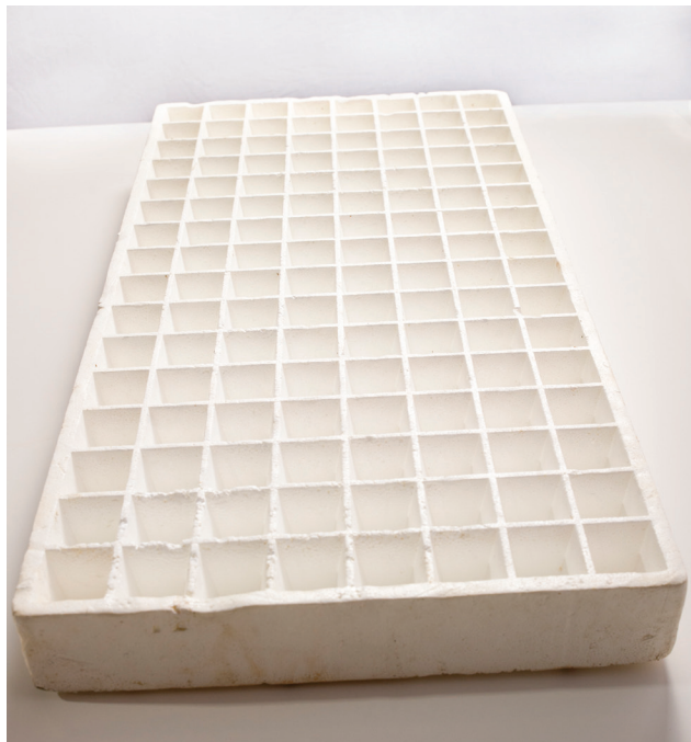
Figure 3. Styrofoam container.

Plastic containers: Plastic containers come in all shapes and sizes and can be either single or multiple use containers (Figure 4). Plastic can be formed into multi-celled