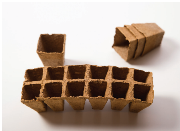
Figure 2. Peat containers.

Styrofoam containers: Styrofoam can be formed into multi-celled transplant trays that are relatively long-lasting and can be reused to grow multiple crops of transplants (Figure 3). These trays are a standard length and width, but the number