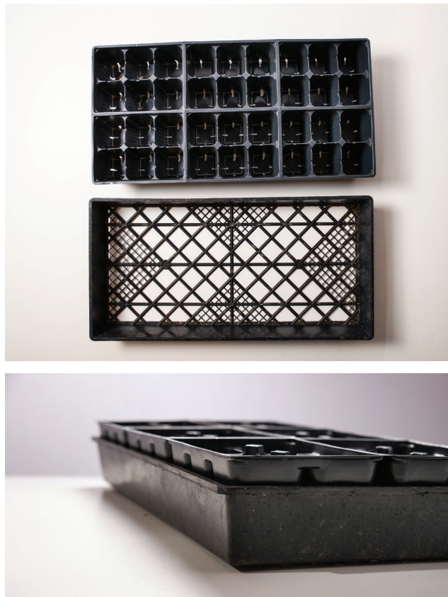
Figure 4. Plastic containers.

container sheets making handling much more efficient. One advantage of plastic is that printed sticky labels will adhere to plastic containers, which allows for labeling of each container. If plastic containers are to be reused, be certain to wash and sanitize them with a 10 percent bleach solution prior to reuse.