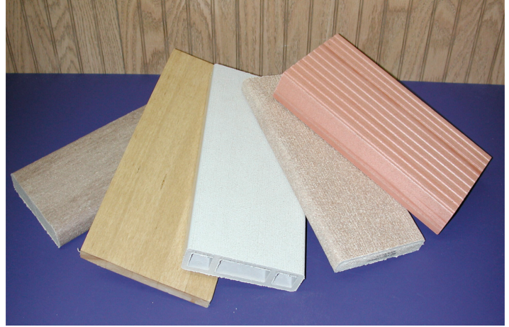
Figure 3. Application of wood plastic composites as decking.