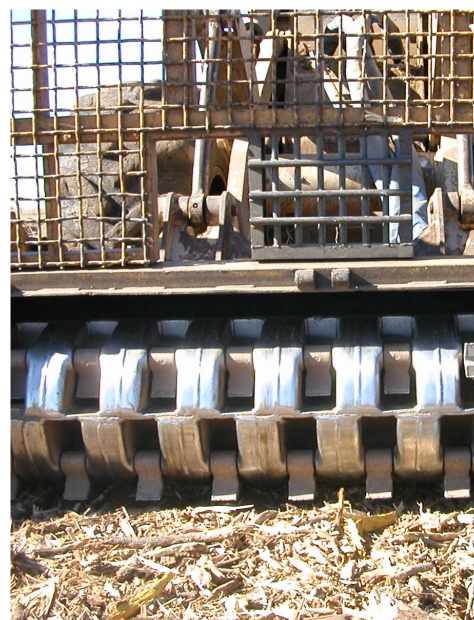
Figure 1. Commercial shredder.

Mesquite is another invasive species that adversely affects cattle and livestock production by reducing forage crops. Mesquite is a sprouting plant ranging from a shrub to a tree and is widely distributed along the Oklahoma and Texas border. The wood has a limited use for furniture, cabinets and game tables.