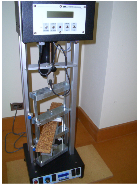
Figure 5. Comten testing system.