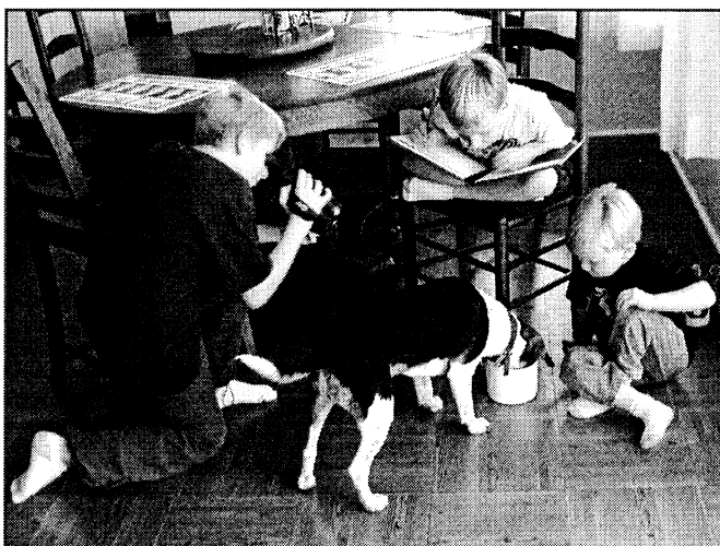
Figure 2. Three citizen scientists conduct a food palatability study (under adult supervision) with their pet beagle.