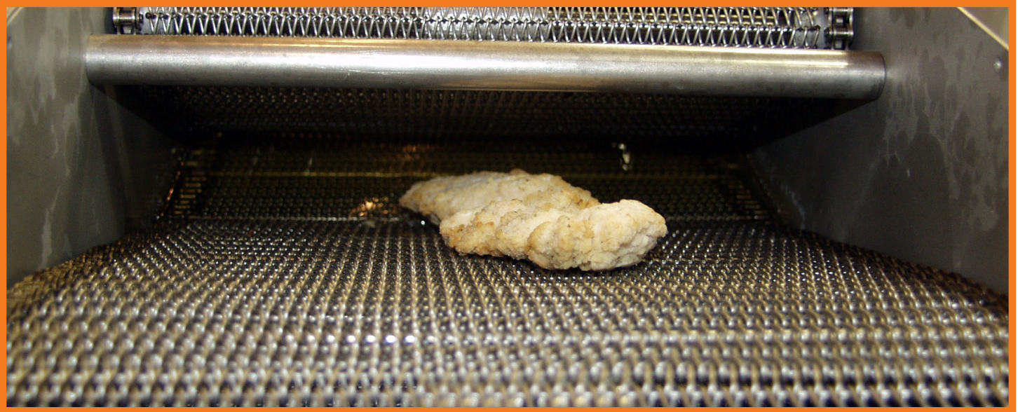
Photo 2. Chicken before the frying process.

Operations outside fryer design capacity alter the temperature profile in the fryer and may lead to excessive heat load, which trigger premature equipment breakdowns and unacceptable product flavor and quality. The fryer operations below the design capacity also may have adverse effects on frying oil and final product quality such as low oil turnover, increased oxidative stress and reduced finished product shelf life.