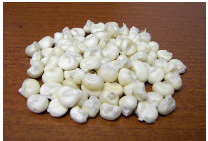
Figure 2. Miami white corn kernels.

It is best to have a thorough understanding of the traits your landrace exhibits and to preserve the ears that resemble the original traits (easily found on GRIN). The best traits to keep an eye on are kernel color, kernel type, number of rows around an ear, ear length, texture of endosperm and days to silk/ripening. Common traits that can be a sign of crosspollination from other varieties are change in kernel type (i.e. flour to dent), increase in rows of kernels, color changes (plant and kernel) and plant dimensions. Traits from crosspollination normally don’t present themselves until the following year (except kernel endosperm and embryo), so keep in mind most selection at harvest is eliminating the previous year’s crosspollination. Actively selecting for the desired traits will minimize the flow of unwanted genes into your seed bank population. In addition to separating your harvest into ears exhibiting wanted and unwanted traits, it is natural to select healthy-looking ears that have performed well in your field/garden for your seed stocks.