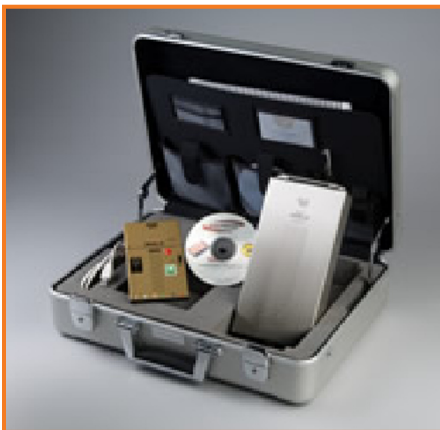
Figure 2. Super Mole Gold temperature data logger by ECD. www.bakewatch.com

Gas oven systems in food processing operations are often overlooked as a source of waste. Many systems are inefficient and pose potential food safety and quality hazards. A wide variety of resources, tools and techniques are available to help diagnose and improve oven systems. Identifying and repairing problems in ovens can be a rewarding experience that results in increased cash flow and improved food quality. As energy prices continue to rapidly increase, the efficiency of oven systems is even more important.