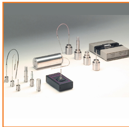
Figure 3. Datatrace data logging system by Mesa Labs. www.mesalabs.com