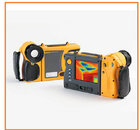
Figure 4. Infrared camera by Fluke Corp. www.fluke.com