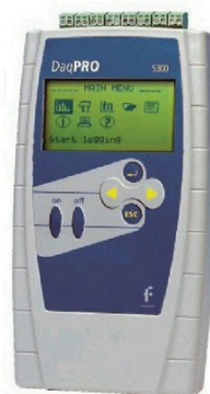
Figure 1. 8-channel data logger for universal inputs (includes thermocouples). www.iseincstore.com

Wet-bulb temperature can be measured by placing a wet cotton sock or tube (available, for example, from Pepperell Braiding Co., Pepperell, Mass.) over the active portion (e.g.