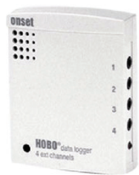
Figure 2. 4-channel data logger for thermistors, RTDs, voltage and current sources.