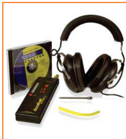
Figure 3. VPE Ultrasonic leak detector, about $900 at www.monarchinstrument.com .