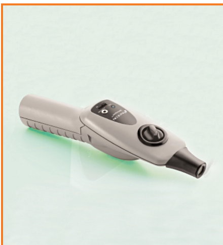
Figure 2. Inficon “Whisper” ultrasonic leak detector, about $270 at www.reliabilitydirect.com .