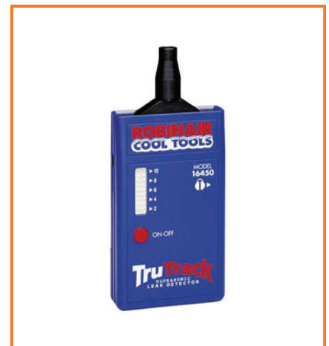
Figure 4. Robinair 16455 Ultrasonic leak detector, about $300 at www.valuetesters.com .