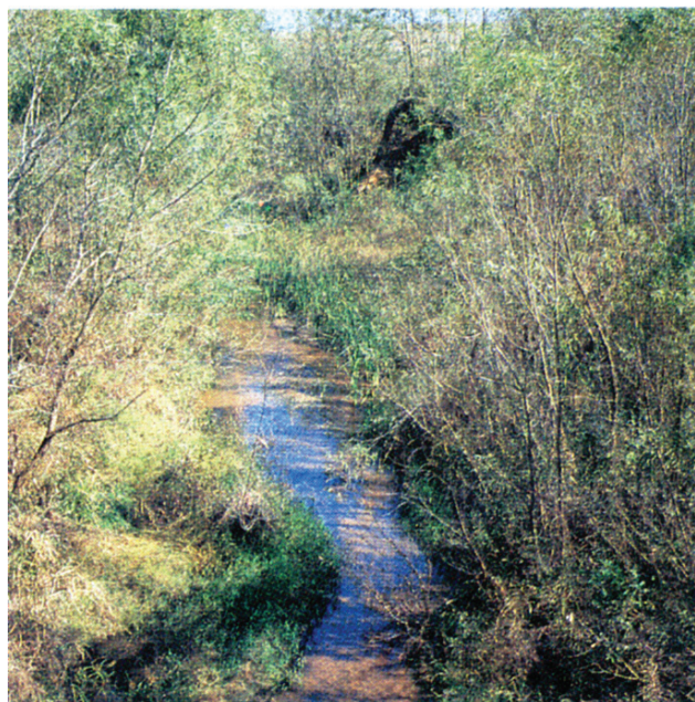
Figure 6. This small creek is in healthy condition with a well-vegetated riparian zone. If brush and trees are cleared, bad consequences will follow. Like most Oklahoma streams and rivers, its fate is in the hands of landowners.

Floodplain – The flat area alongside the stream channel that receives floodwaters and sediment when the stream overflows.