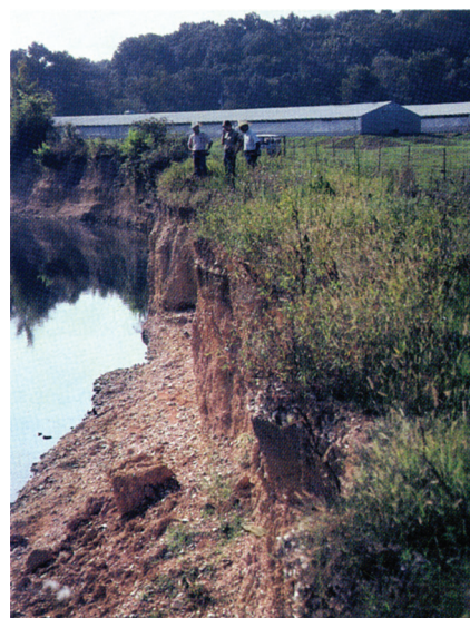
Figure 5. This high cut bank is the sign of an unhealthy, unraveling stream channel. The channel is being widened as the stream seeks to meander. Once a stream has been degraded this severely, there is little a landowner can do about it.