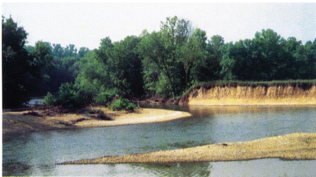
Figure 1. A high cut bank in the background and a mid-channel sediment bar in the foreground indicate that this stream is out of balance. The undercutting and collapse of streambanks contributes excess sediment to the stream. As that sediment forms mid-channel bars, stream flow is directed against the banks causing more undercutting and collapse.

The movement of water and sediment through a stream system involves kinetic energy . The faster the stream flows,