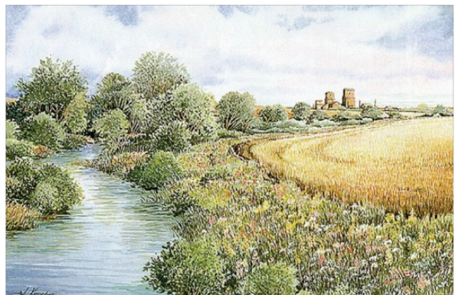
Figure 2. Healthy riparian zones are alive with trees, shrubs or other deep-rooted plants that resist the cutting power of the flowing water and protect streambanks from erosion. (With permission by Wendy Kroeker, artist, and Manitoba Association for Community Arts Councils Inc.)

The second way streams act to dissipate the erosive energy of flowing water is by changing their pattern or meandering (Figure 3). By forming curves the distance the water travels is increased, the slope is decreased, and the water's velocity slows as a result. It is normal for stream and river channels to slowly move over time. If one could watch a stream from the air over a period of several lifetimes, it would appear as if it were a writhing snake. This is one reason why construction of homes and other structures close to streams should be discouraged.