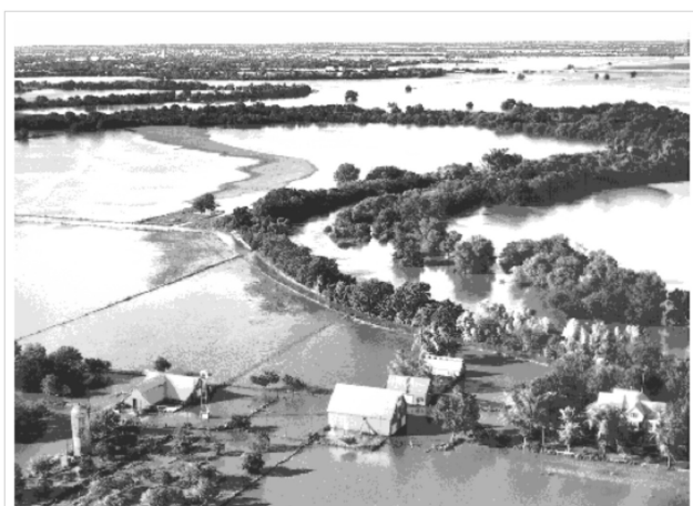
Figure 4. It is important to recognize floodplains and understand how they work. See "Further Information" for sources of floodplain maps for your area. Always check a floodplain map before buying or building a home or other structure close to a waterway.

The failure to understand and respect how nature allows streams to resist erosion can lead to serious problems. While there may be engineering methods for solving these problems, the costs are quite high and almost always beyond the reach of the private landowner. It is far better to understand and respect the ways in which nature regulates stream erosion and avoid such problems (Figure 5).