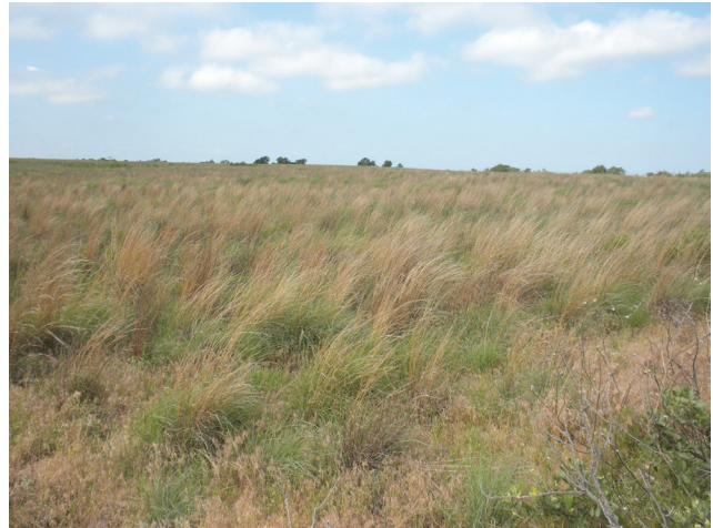
Dense grass cover such as this native CRP field provides excellent nesting habitat for pheasant.

Nesting cover is often limiting for pheasants, particularly in areas with intensive farming. Pheasants nest in dense grass cover. As pheasants nest early in the summer, it is important that residual grass cover remain from the previous growing season.