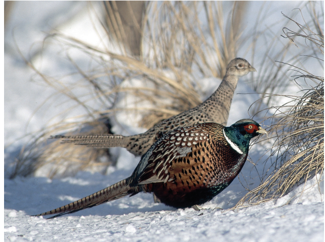
Pheasants are one of the most popular game birds in Oklahoma and the U.S.

Oklahoma Cooperative Extension Fact Sheets are also available on our website at: http://osufacts.okstate.edu