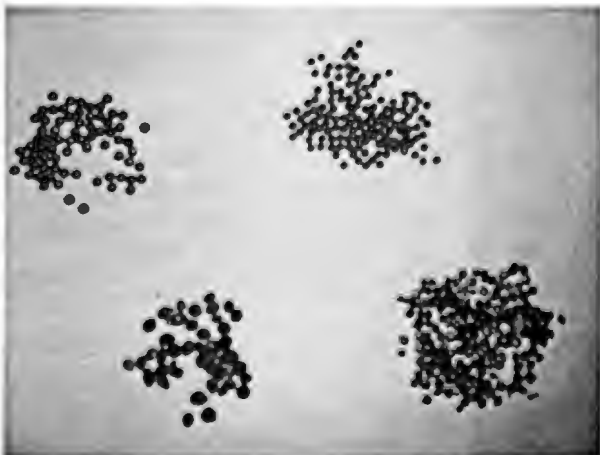
Figure 1. Popular shot sizes for bird hunting is similar in size to many preferred game bird foods. Clockwise from top left, #6 lead shot, #8 lead shot, wooly croton seed and Pennsylvania smartweed seed.

Upland game birds also are susceptible to lead poisoning. Lead impacts have been documented for virtually every species of upland game bird in the U.S., including ring-necked pheasant, northern bobwhite and wild turkey, but perhaps no other upland game bird is more at risk than the mourning dove. The primary reason for their susceptibility is the same as waterfowl's--concentrated hunting. Some dove fields collect more than 2.5 million pellets per acre each year. Since the ground is often bare or nearly so in prepared fields, lead is more available for ingestion. Also, the size shot commonly used for dove hunting is very similar to seeds consumed by the mourning dove (Figure 1). Doves have difficulty maintaining their core body temperature after ingesting lead and appear to die rapidly. As few as two pellets can kill a mourning dove, but doves often consume multiple pellets (Figure 2). There is little known about the impacts of lead on passerine bird spe-