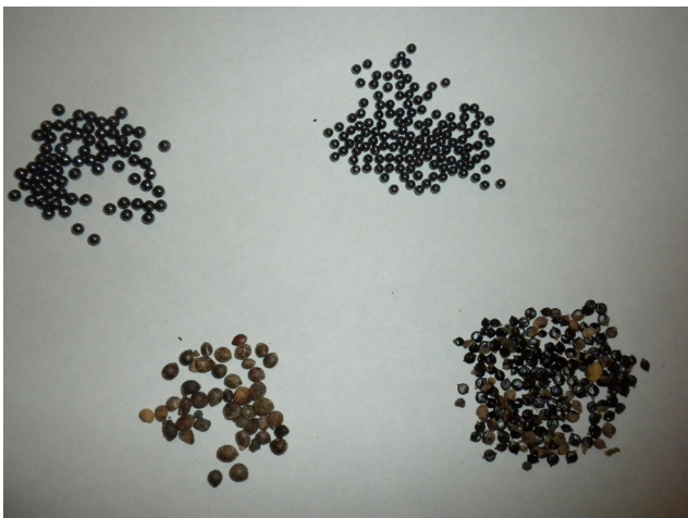
Figure 1. Popular shot sizes for bird hunting is similar in size to many preferred game bird foods. Clockwise from top left, #6 lead shot, #8 lead shot, wooly croton seed and Pennsylvania smartweed seed.

Upland game birds are also susceptible to lead poisoning. Lead impacts have been documented for virtually every species of upland game bird in the U.S., including ring-necked pheasant, northern bobwhite, chukar and wild turkey, but perhaps no other upland game bird is more at risk than the mourning dove. The primary reason for their susceptibility is the same as waterfowl—concentrated hunting. Some dove fields collect more than 2.5 million pellets per acre each year. Since the ground is often bare or nearly bare in prepared fields, lead is more available for ingestion. Also, the size shot commonly used for dove hunting is very similar to seeds consumed by the mourning dove (Figure 1). Doves have difficulty maintaining their core body temperature after ingesting lead and appear to die rapidly. As few as two pellets can kill a mourning dove,