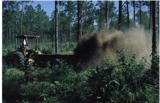
The high (8 tons/acre) and high (16 tons/acre) rates were applied with a basic tractor drawn manure spreader.

This publication reports on some preliminary research into the application of poultry litter to a pine plantation and attempts to answer the following questions: