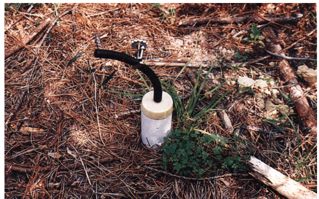
Two Lysimeters were located in each plot and soil water was collected after each significant rainfall.

Soil water nitrate concentrations in the high and very high poultry litter plots showed significantly higher levels than the plots which received no fertilizer. This effect lasted throughout the entire monitoring period. The medium and the chemical treatments resulted in significantly higher concentrations only through the tenth storm, approximately one year after application. The low treatment showed no statistical difference from the control treatment. Soil water phosphorus concentrations varied widely, making the statistical model invalid for most storm events. Phosphorus concentrations in the very high treatment were significantly greater than in other treatments for several storm events.