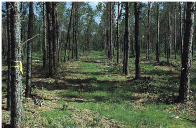
After thinning equipment could be driven down the rows where trees had been removed