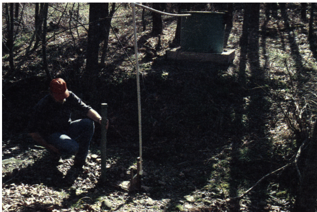
The monitoring sites were located in an intermittent stream channel. The downstream location is shown here. Water samples were automatically collected during stormflow events.