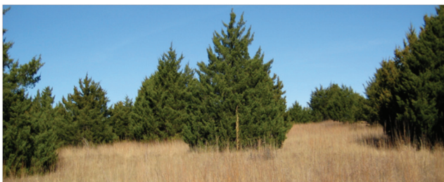
Figure 1. Encroachment of redcedar in a mesic grassland at OSU's Cross Timber Experimental Range near Stillwater.

Water enters watersheds as precipitation, primarily rainfall in Oklahoma. A portion of the precipitation is captured by the vegetative canopy (redcedar or grass) and the litter layer and evaporates back into the atmosphere. The evaporative loss of water from the vegetative canopy or litter is called interception. The remaining water will either infiltrate into the soil or produce