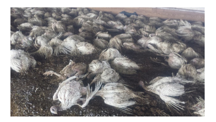
Figure 1. Turkey mortality resulting from highly pathogenic avian influenza.

Biosecurity is a practice utilized to limit the spread of disease causing organisms. In this case, biosecurity means doing everything possible in an operation to prevent disease