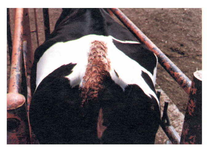
Photo 4. The dried, crusty appearance of tail-chalk about 10 days after being applied. This cow has not been in heat.

Occasionally, a cow will lick off the chalk, as was the case of the cow in Photo 5. The obvious lick marks on the hair of the tailhead indicate that she had not been ridden.