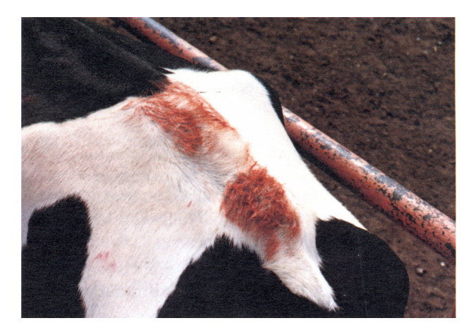
Photo 5. A few cows will lick at the tail-chalk, resulting in the bare area with the smooth lick marks apparent on the hair.

Tail-chalking is an aid to good heat detection. However, it should not be expected to replace the trusted method of spending a half-hour in the morning and a half-hour in the evening each day carefully observing the cattle.