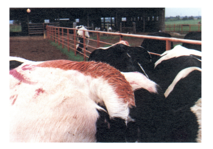
Photo 2. The same cow as in Photo 1 after riding activity has begun. Note ruffled appearance of the chalk and presence of foreign hair from the mounting animal that is caught in the chalk. The narrow, reddish mark on the extreme left has been applied by a chin-ball marker.

An economical heat detection aid is used at many U.S. dairies. This method is called "tail-chalking" and involves only