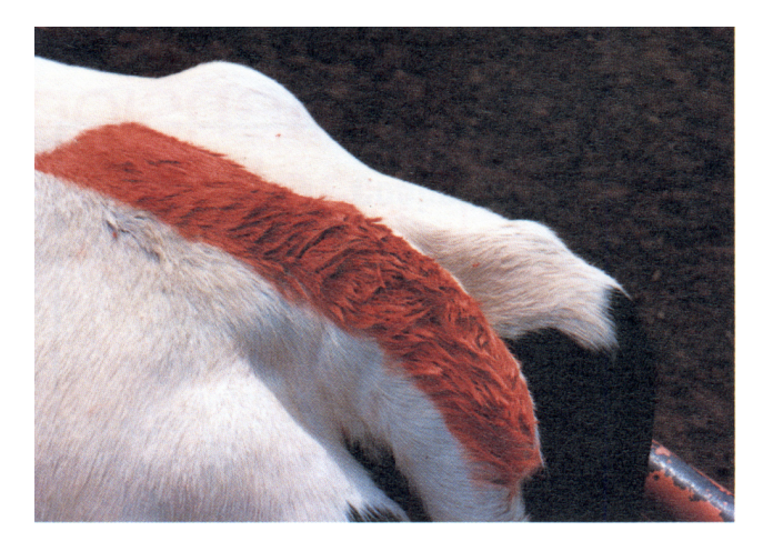
Photo 1. A freshly "chalked" cow illustrating the position of the tail-chalk from between the hook or hip bones to the vertical descent of the tail.

heat detection. This fact alone is considered a major cause of heat detection inefficiency. Many of the cows that do have a "standing heat" from midnight to 6 a.m. can be observed as having "secondary" signs of heat at the time of normal heat detection on the previous evening. The secondary signs of heat include: 1) a willingness to mount other cows, even though neither cow may be willing to stand for the mount; 2) roughened tailhead or mud on the rump, which is evidence that other animals have tried to mount her; 3) restlessness, which may be indicative of a cow about to exhibit heat (cows in pre-heat may bawl more than usual, head-butt, pace the fence, sniff or lick other cattle); 4) clear stringy mucus discharge, which may be hanging from the vulva or smeared on the pin-bones or rump of a cow about to have or in estrus. Bloody mucus often appears 2 to 3 days after estrus has occurred and should be recorded in order to closely watch for heat in 17 to 21 days.