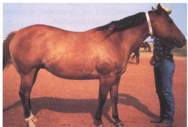
Figure 6. Broodmare in early gestation in Body Condition 7: Fleshy. Note noticeable filling between the ribs, roundness of tailhead, and appearance of fat behind the shoulder.