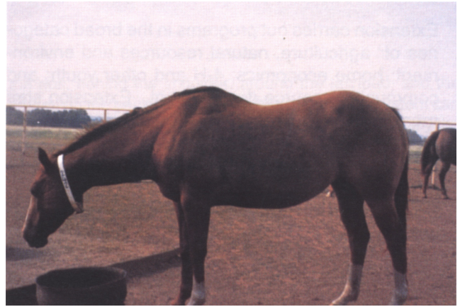
Figure 4. Broodmare in early gestation in Body Condition 5: Moderate. Note shoulders and neck blend smoothly into body. No visual appearance of ribs.