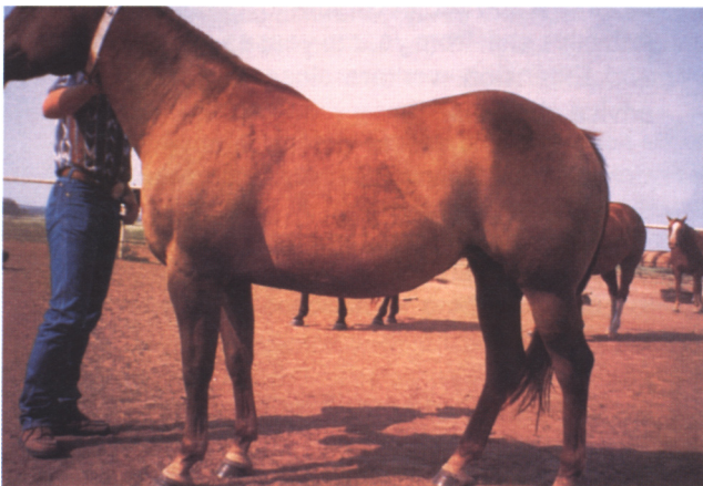
Figure 5. Broodmare in early gestation in Body Condition 6: Moderate to Fleshy. Note fat deposits along sides of withers, behind shoulders, and along the sides of the neck.