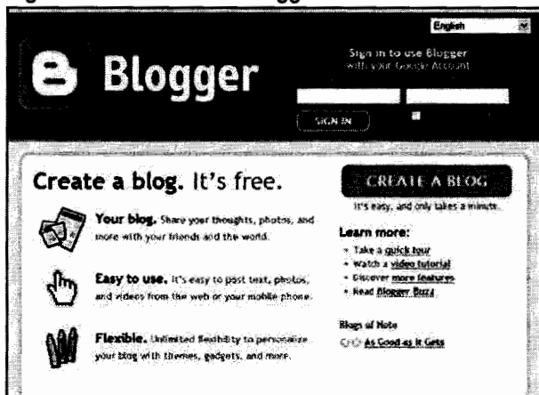
Figure 3. Screen shot of Blogger.