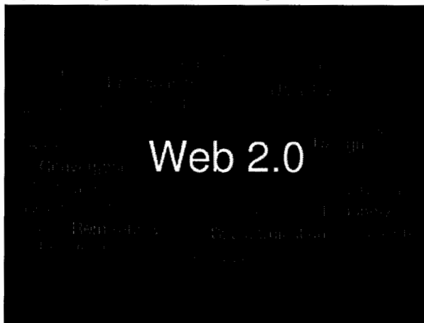
Figure 1. "Tag Cloud" representing Web 2.0.

Despite these statistics, a relatively recent survey indicated that most small businesses were not very optimistic about how Web 2.0 tools can help them (Simonds, 2007). As people become increasingly comfortable with these types of online experiences, it makes good business sense to see if they can be utilized to promote and advance your small business – giving you a competitive advantage over other businesses that are not willing to incorporate them.