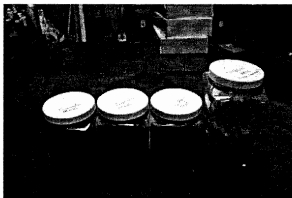
Figure 3. Co-products from seed crushing oilseeds for biodiesel production can include seed meals that can be used as livestock feeds.

For more information on DEQ water permits, visit http://www.deq.state.ok.us/wqdnew/wqprogrms.html .