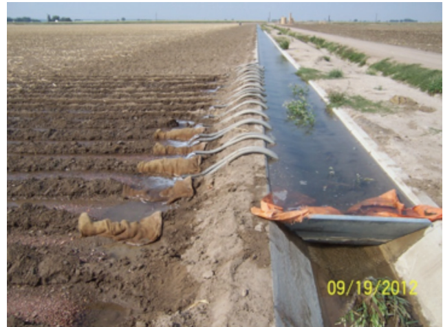
Figure 2. Furrow irrigation using siphon tubes, Northern Colorado.

In furrow irrigation, the soil surface is channeled and furrows are formed to direct the flow and avoid flooding the entire field (Figures 2 and 3). Water moves in these furrows and seeps through their walls and bottom. Each furrow receives an inflow of water, which could be provided by means of hand-