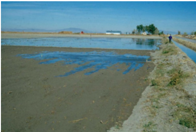
Figure 1. Basin irrigation in central Utah.

Border irrigation is different than basin because the borders are rectangular in shape, have a sloping surface, and are not diked at the tail end (free drainage). Borders are appropriate for irrigating almost all crops, except those that require ponding conditions (e.g. rice). The inflow rate should be identified carefully as large enough to allow water front advancement, but not too large to erode the fertile top soil out of the field.