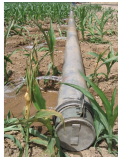
Figure 3. Furrow irrigation using gated pipes, Northern Colorado.