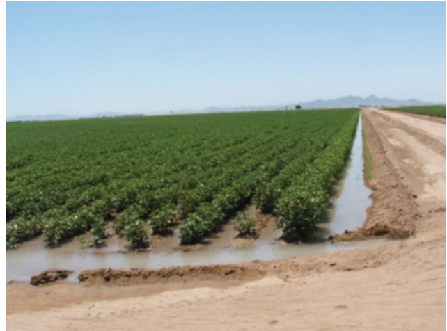
Figure 4. Furrow irrigation of cotton in Southern California.

Although improving irrigation efficiency has several benefits, it should be noted that the “lost” portion of water at one field is usually a source of water for another user somewhere downstream. As a result, increasing efficiency by reducing return flows (deep percolation and surface runoff) may negatively affect downstream users. That is why capturing surface runoff and reusing it at the same field is not allowed by the water law in several western States.