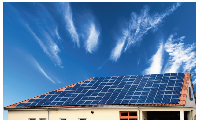
Figure 1. Solar PV Panels on Home Roof (powerupelectric.com).

Oklahoma Cooperative Extension Fact Sheets are also available on our website at: http://osufacts.okstate.edu