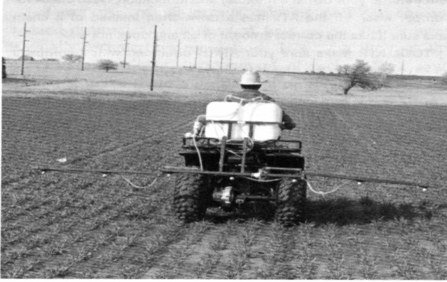
Figure 3. ATV equipped with a sprayer and boom.

When loading an ATV, try to keep the machine well balanced. Balancing an ATV often requires adding weight to the front of the machine to counterbalance loads on the rear. Also balance loads crosswise to keep the ATV from “pulling” to one side. Secure tools in a fashion that allows the rider to safely operate the machine.