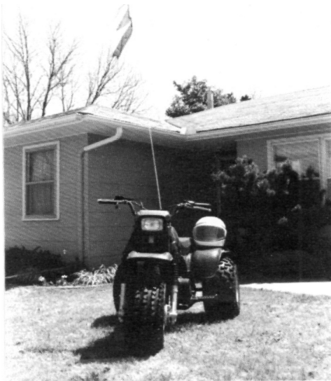
Figure 2. ATVs operating in state owned riding areas must have a 10' whip antenna with a bright red or orange flag.

Another major cause of ATV accidents is failure to ride within their skills. Stay away from tough riding areas such as steep inclines and extremely rough terrain, until riding skills have developed. Riders younger than 16 years of age are more likely to have accidents, because they often feel they have mastered all riding skills after a short period of time. Experienced riders should always supervise riders within this age group until their riding skills have fully developed.