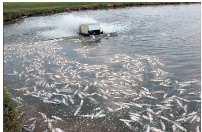
Figure 1. The price of poor water quality management is dead or sick fish.

The most critical technical factor in aquaculture is water quality. Oxygen levels in water can drop quickly and suffocate fish. Dissolved wastes produced by fish can build up in water, damaging delicate gills and elevating levels of harmful substances in the bloodstream. Fish farmers can deal with these dangers, but only after they have learned how to use water quality test equipment. The Cooperative Extension Service in most southern states offers water quality workshops for fish farmers. These workshops provide hands-on experience using test equipment and teach what the water quality numbers mean and what management actions to take (see SRAC Publication Nos. 370, 371, 462, 463, and 464). New fish farmers who delay buying and learning to use test equipment often believe the warnings do not apply to them. Then suddenly they discover an entire pond of dead or sick fish (Figure 1). Producers who take the time to check oxygen, ammonia, nitrite, and other water quality factors on a regular basis find that it pays off by greatly reducing fish kills and disease problems.