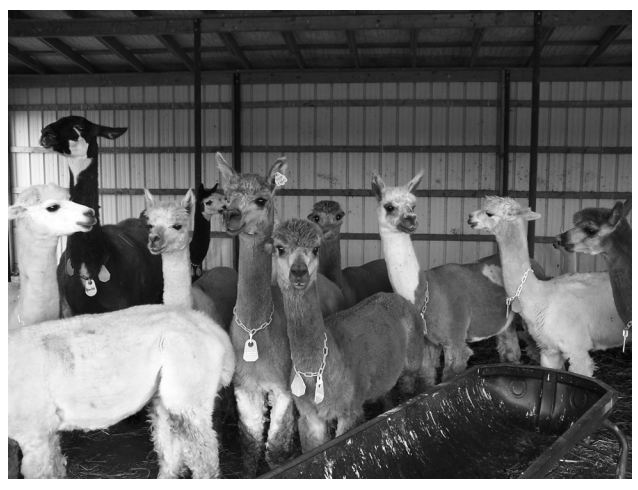
Llamas and Alpacas are easy to train and work with.

Oklahoma Cooperative Extension Fact Sheets are also available on our website at: http://osufacts.okstate.edu