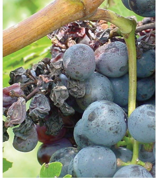
Fig 4. Ripe rot