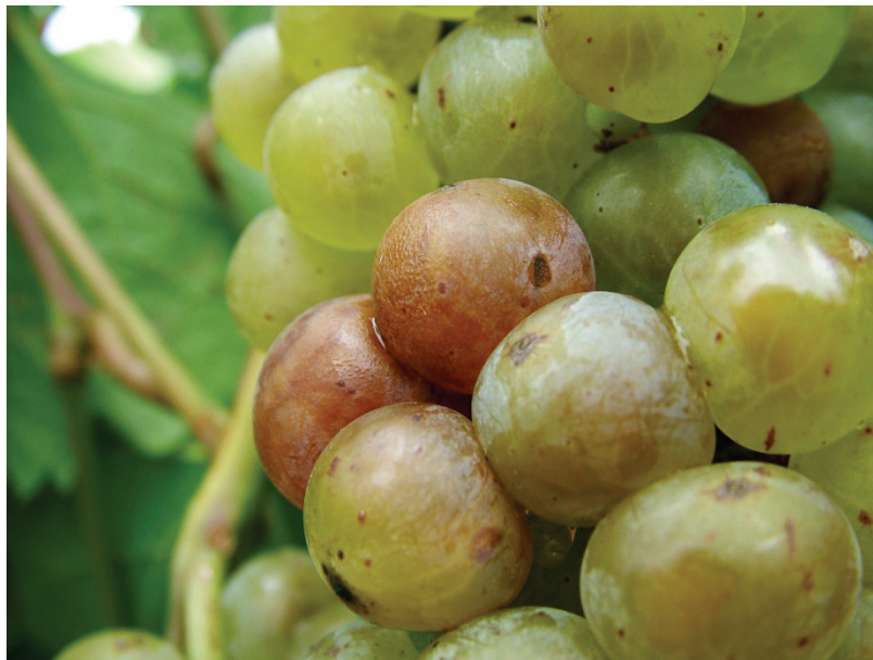
Fig 5. Macrophoma rot