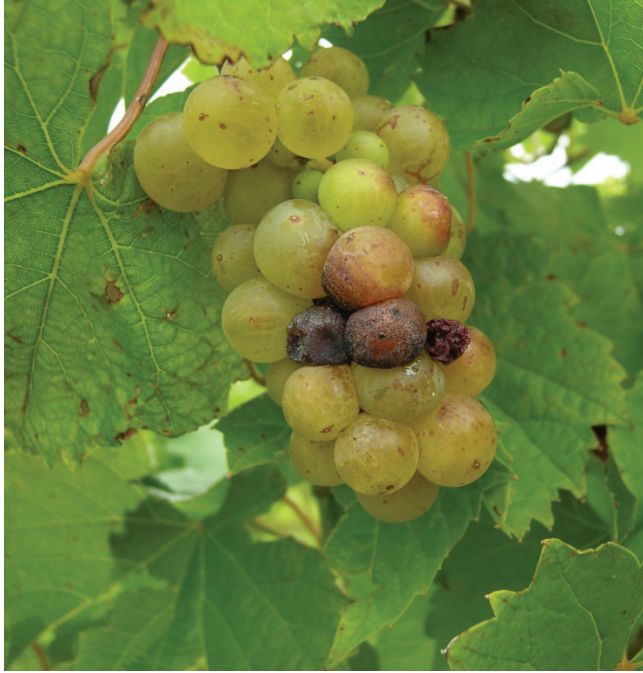
Fig 3. Bitter rot of Vignoles