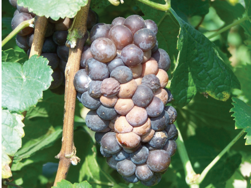
Fig 6. Sour rot

Sour rot (Fig. 6) can be a problem on fruit that has been “wounded”. This problem is a complex of fungi, bacteria, and insects that gain entry via wounds of fruit. Fungicides are not effective for this disease. The best method of managing this problem is to be diligent about preventing damage to fruit and controlling insect pests as part of a sound integrated pest management program.