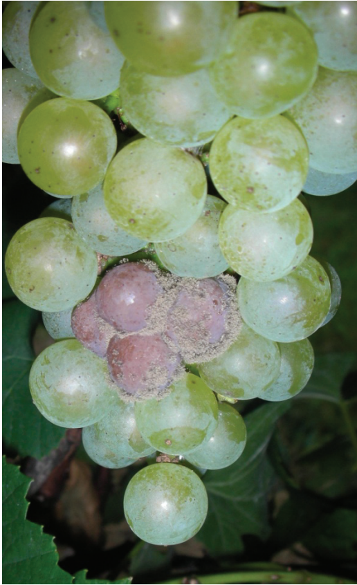
Fig 1. Botrytis bunch rot