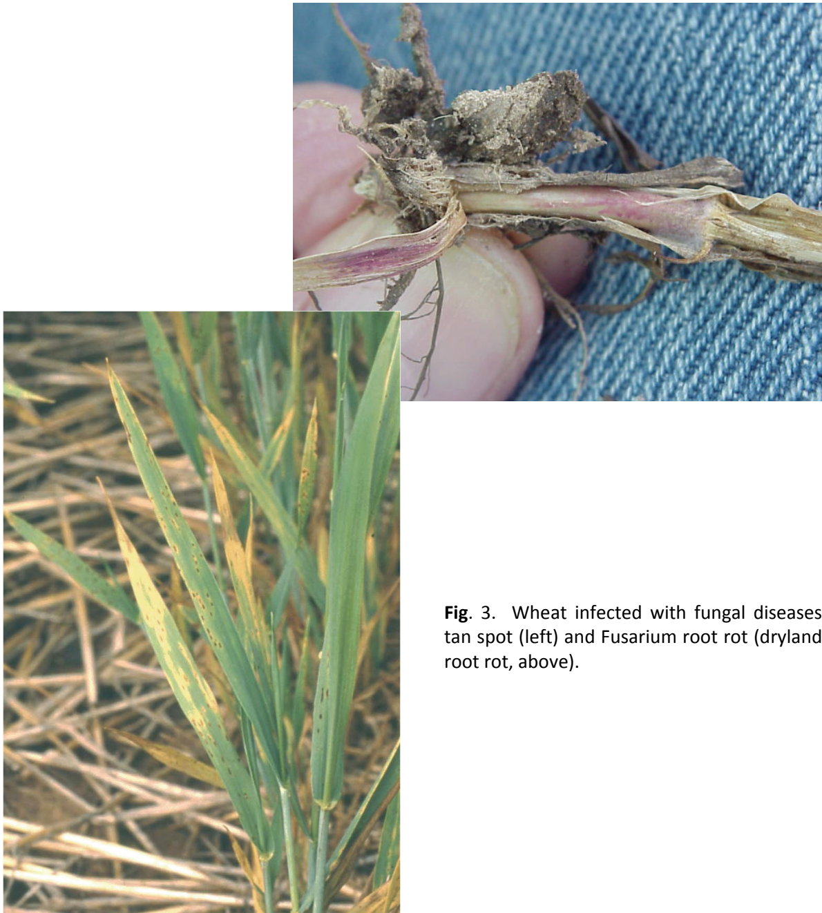
Fig. 3. Wheat infected with fungal diseases tan spot (left) and Fusarium root rot (dryland root rot, above).

Root and foot rots: These include several diseases caused by fungi such as dryland (Fusarium) root rot, take-all (Fig. 3), Rhizoctonia root rot (sharp eyespot), common root rot, and eyespot (strawbreaker). Controlling root and foot rots is difficult. There are no resistant varieties, and although fungicide seed treatments with activity toward the root and foot rots are available (see Table 1), their activity usually involves early season control or suppression rather than control at a consistently high level throughout the season. Often, there also are different “levels” of activity related to different treatment rates, so again, CAREFULLY read the label of any seed treatment to be sure activity against the diseases and/or insects of concern are indicated, and be certain that the seed treatment(s) is being used at the rate indicated on the label for activity against those diseases and/or insects.