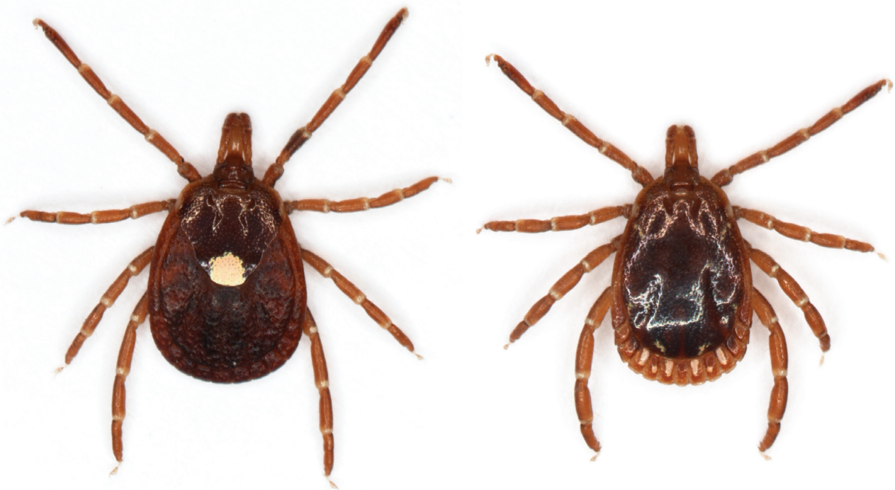
Fig 2. Lone Star Tick, female (left) and male (right).

There are two tick species abundant during this time of year in Oklahoma. The first is the Lone Star Tick ( Amblyomma americanum ) which is probably the tick most commonly encountered by people during recreational activities in Oklahoma. The female can be easily distinguished from other ticks by the lone white spot on its back (Fig. 2). This is considered a three-host tick, unfortunately all life stages can be found on humans. This tick is active from early spring through late fall in Oklahoma. It is known to transmit human ehrlichiosis, tularemia, and American Q fever. Of these, tularemia is largely vectored by this tick. Another illness that has been recently identified as being transmitted by the Lone Star Tick is Southern Associated Rash Illness (STARl) which is sometimes confused with Lyme disease. If you would like more information on these specific conditions visit the CDC website at www.cdc.gov .