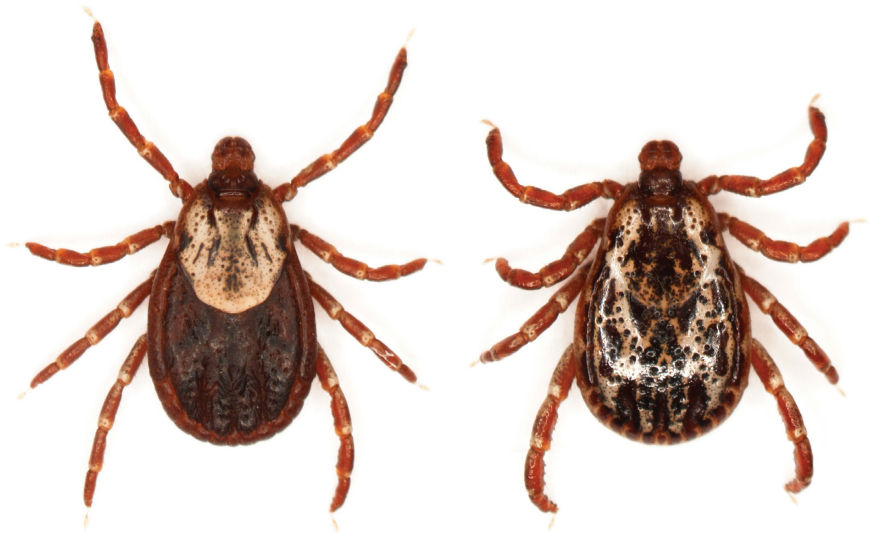
Fig 3. American Dog Tick, female (left) and male (right).

Both of the previously mentioned ticks can be found in or around your lawn. Listed below are good practices to take into account when going into a potential tick infested area: