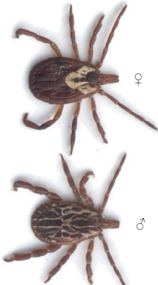
Gulf Coast Ticks

It is time to start checking cattle for Gulf Coast Ticks especially if you have had problems with this tick in the past. Gulf Coast Ticks ( Amblyomma maculatum ) are found in the ears of cattle. Heavy infestations cause the ears to become thickened and curled, causing a condition called “gotch ear.” This tick is considered a three-host tick and as larvae and nymphs, they are commonly found on ground-inhabiting birds, such as meadowlarks and bobwhite quail, or small rodents. This tick has become increasingly more abundant in eastern Oklahoma and infestations can be seen on cattle from early April to mid-June. They are reddish brown with pale lines along the back and very similar to but slightly smaller than American Dog Ticks. Gulf Coast Ticks have longer mouthparts than the American Dog Tick. This tick is considered a presumed vector of Ehrlichia ruminantium , the rickettsial causative agent of heartwater, an African disease of ruminants that may enter the United States from the Caribbean. This tick has also been documented to cause tick paralysis in cattle. Recently, research has demonstrated that this tick can vector a closely related rickettsial bacterium of the causative agent of Rocky Mountain Spotted Fever, Rickettsia parkeri . In 2004, the first confirmed human infection with R. parkeri was reported and has since been detected in Gulf Coast Ticks from Oklahoma.