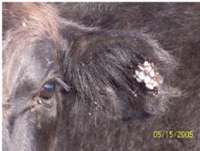
"Gotch ear" from a Gulf Coast Tick