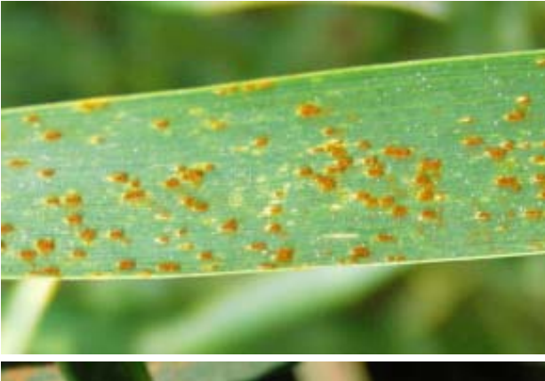
Fig 1. Wheat leaf rust

• Stem rust of wheat, which I found on stems of McNair 701 near Stillwater on about May 21. Samples were collected and sent to the Cereal Disease Lab in Minnesota. Please note the comparison between wheat leaf, stripe and stem rust in Figures 1-3.