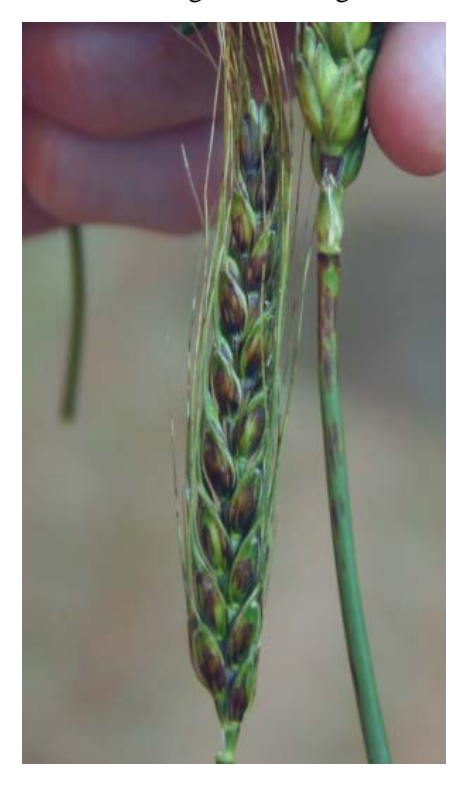
Fig 4. Black chaff

• Symptoms consistent with the bacterial disease black chaff (Figure 4) have been observed and reported from northern and southwestern Oklahoma. Note the dark discoloration as well as the banding pattern of alternating dark and light bands on the awns.