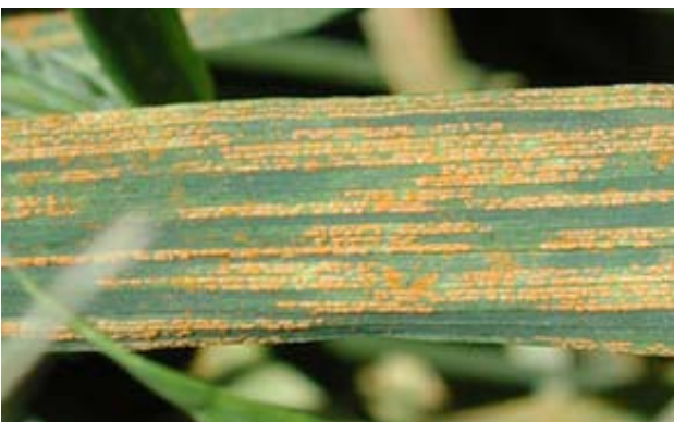
Fig 2. Wheat stripe rust