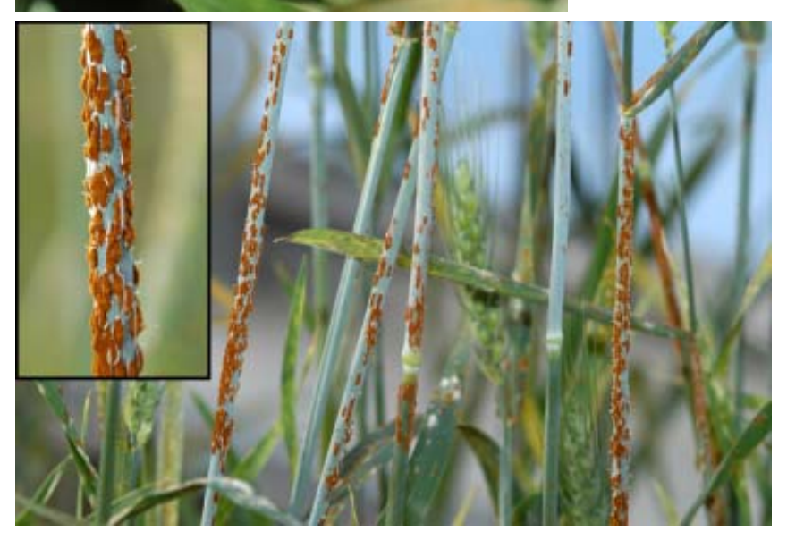
Fig 3 . Wheat stem rust.jpg