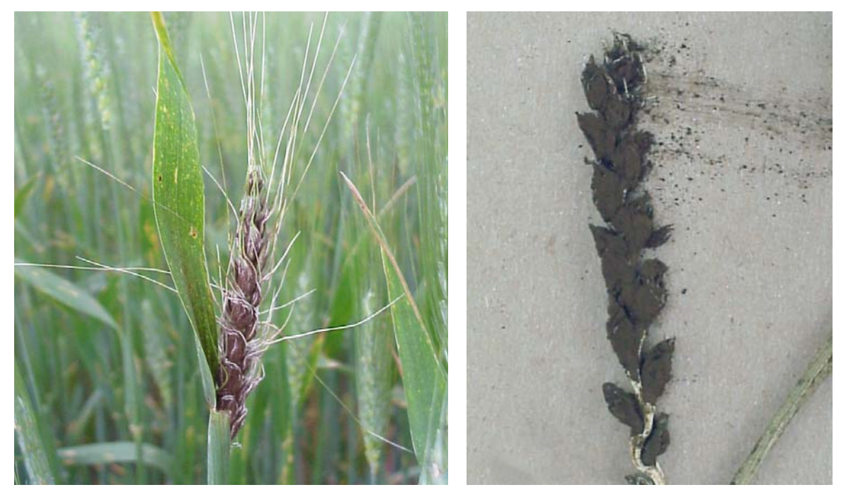
Figure 1. Various views of heads (ears) of wheat plants infected with the loose smut fungus. Note the replacement of kernels with a loose mass of black, powdery spores.

Loose smut: Heads emerging in the spring from loose smut-infected plants are a mass of black spores of the fungus (Figure 1) that spread to the flowering heads of healthy wheat plants where immature kernels are infected. Hence, the loose smut fungus is carried inside of wheat seed, and when that infected seed is planted in the fall the loose smut fungus grows with the plant through the fall and winter. At head emergence in the spring, masses of black, powdery spores emerge instead of a typical wheat head. Hence, wheat grain infected with loose smut does not appear different from uninfected wheat grain, and there is no foul odor associated with loose smut-infected grain as there is with wheat grain contaminated with common bunt.