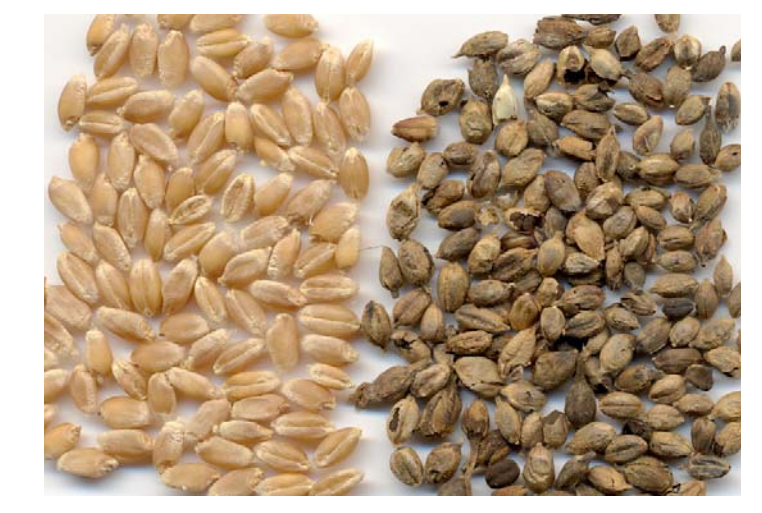
Figure 2. Wheat seed from a healthy wheat plant (left) and from a wheat plant infected with common bunt (right).

Common bunt (also called 'stinking smut'): Wheat kernels from plants infected with common bunt are slightly smaller than an uninfected wheat kernel and are dark brown or black in color (Figure 2). The seed coat on these bunted kernels is easily crushed, which releases the bunt spores and the foul smelling odor. During harvest, these bunted kernels are broken and the spores are released to spread to the coat of healthy wheat (Figure 3) and to the soil. Hence, the common bunt fungus survives the summer in the soil and on the seed coat. These spores germinate in the soil when temperatures are cool (<75 F), the fungus infects young, germinating seedlings, and then the fungus grows with the developing wheat plant through the year. As the plant matures, common bunted kernels rather than healthy kernels are formed in the head.