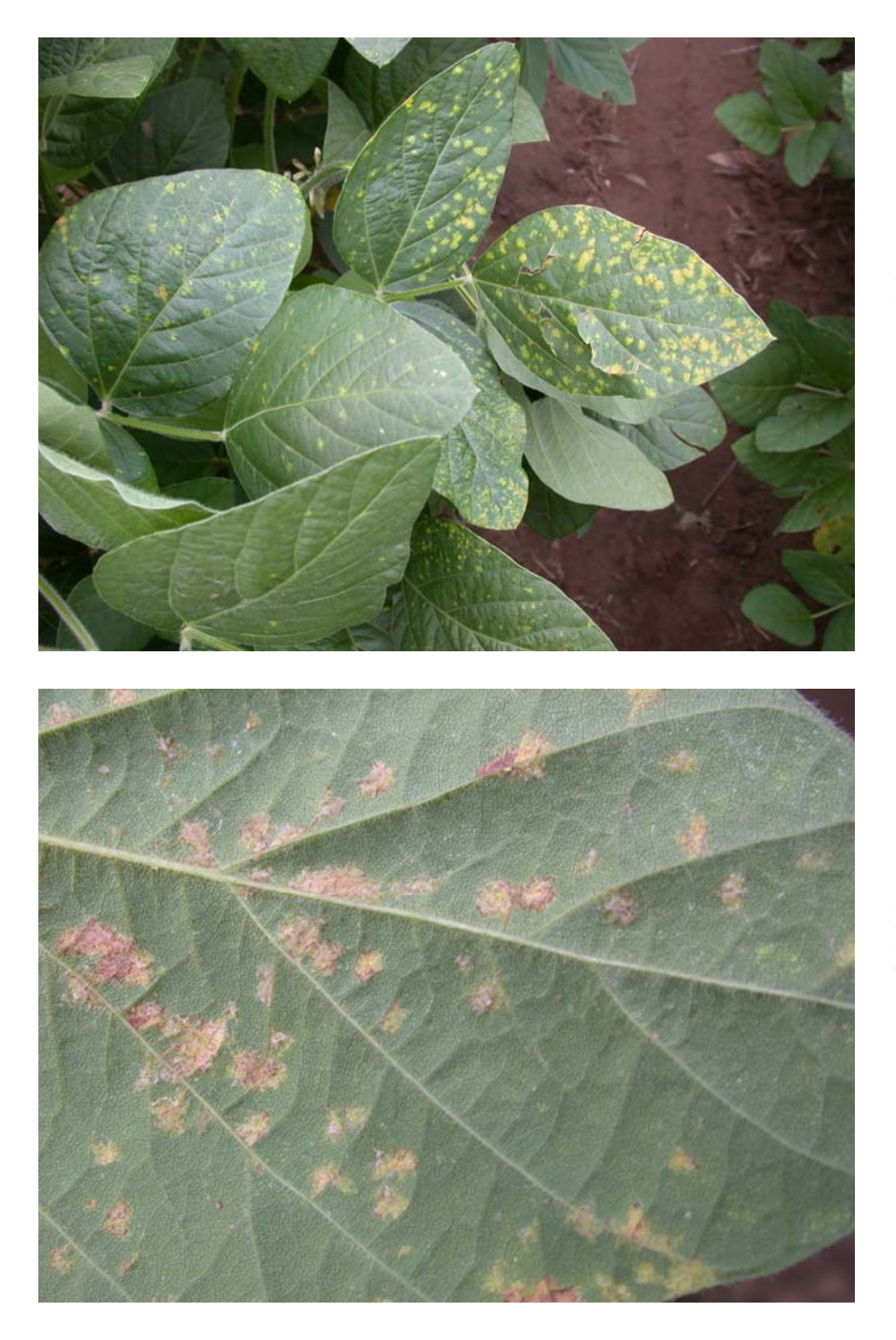
Fig. 3 . Chlorotic spots on soybean leaves caused by downy mildew.

Downy mildew has also been observed in a few fields (Figs. 3 and 4). It was observed in Ottowa Co. in a few commercial fields and is pretty heavy MG4 and MG5 plots at Haskell. Unlike brown spot which starts low on the plant, downy mildew tends to occur in the upper parts of the plant canopy. Downy mildew is also generally regarded as a minor disease of soybean.