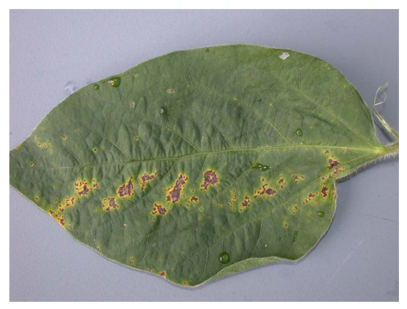
Fig. 5. Bacterial leaf disease on soybean.