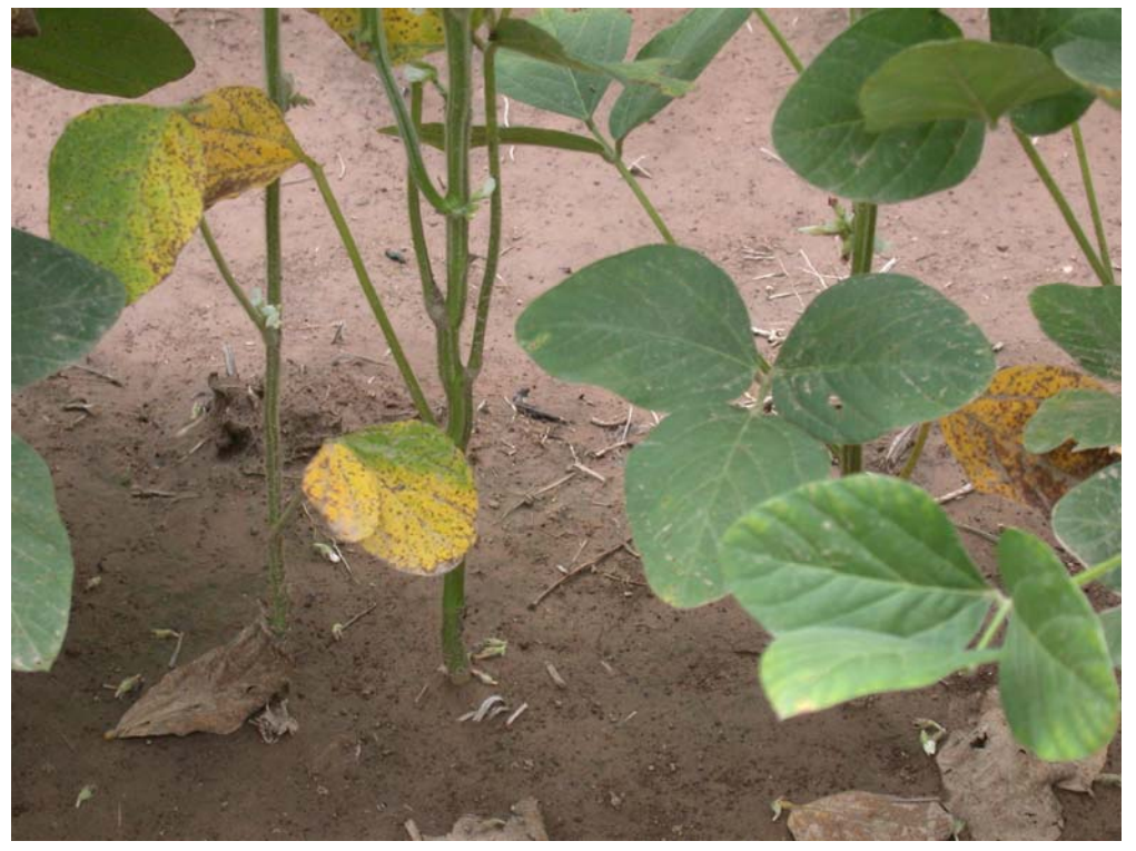
Fig. 1. Brown spot ( Septoria ) in the lower canopy.

lower level. We may still learn something about the effects of fungicides on brown spot, and the effects of brown spot on yield from this trial. The disease is generally regarded as minor.