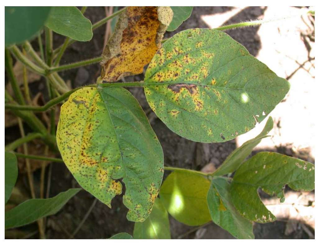
Fig. 2. Close up of brown spot.