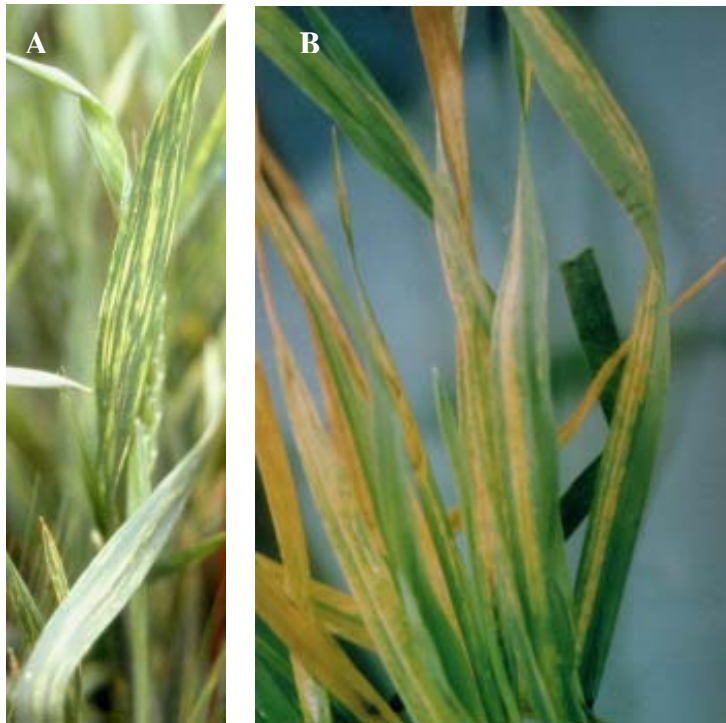
Fig 3. Wheat streak mosaic virus (A), high plains virus in wheat (B).

(WSMV) or go to the Plant Disease & Insect Diagnostic Laboratory web page at: http://entopl.okstate.edu/ddd/hosts/wheat.htm .