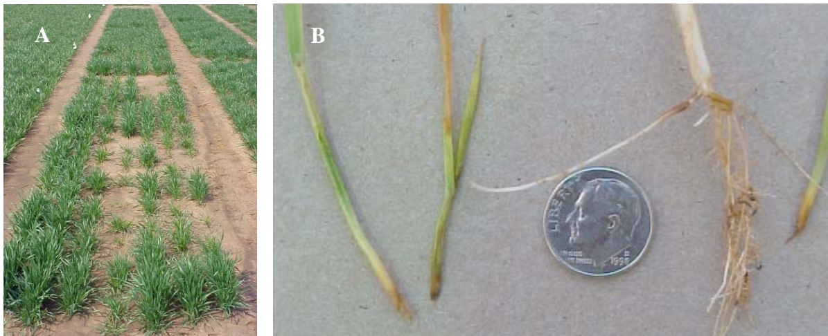
Fig 1. Poor stand in fall from seedling root rot (A), seedlings with rotted roots due to dryland root rot (B).

Root and foot rots: These root and foot rots are all caused by fungi, many of which can result in poor stands in the fall (Fig 1). Specific diseases include dryland root rot ( Fusarium ), sharp eyespot ( Rhizoctonia ), common root rot ( Bipolaris ), take-all ( Gaeumannomyces ), strawbreaker or eyespot ( Pseudocercospora ) and browning or Pythium root rot ( Pythium ). Controlling the root and foot rots is difficult. There are no resistant varieties or fungicide treatments that control all of these diseases at a consistently high level. Although late planting (after October 1 in northern OK, and after October 15 in southern OK) helps to reduce the incidence and severity of root rots, it will not entirely eliminate their presence or effects. If you have a field with a history of root rot, plant that field as late as possible or plan to use it in a "graze-out" fashion. In addition to planting date, take-all is greatly favored by a high soil pH (>6.5). Thus, when liming fields to correct for acid soils, be sure not to raise the pH above this level. Elimination of residue also helps control take-all, and can be somewhat helpful in reducing some of the other root rots. However, research has shown that elimination of residue by tillage or burning does not affect the incidence or severity of strawbreaker. For more information on wheat root rots, take-all and strawbreaker, see OSU Extension Facts F-7622 or go to http://entopl.okstate.edu/ddd/hosts/wheat.htm .