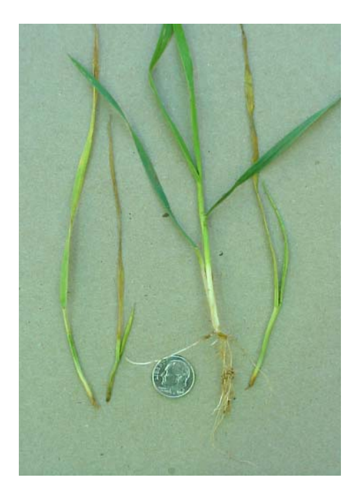
Figure 1. Seedling tillers rotted at base due to Fusarium . Compare rotted tillers to healthy seedling (second from right).

Figure 2. Spores of the fungus Fusarium isolated from