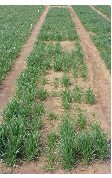
Figure 3. Poor stand resulting from seedling root rot.