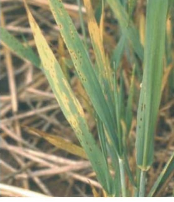
Fig 4. Typical foliar lesions of tan spot. Note the heavy layer of residue on the soil surface which served as the source of the spores causing these lesions.

Fig 3. Pseudothecia (spore producing structures) of the fungus that causes tan spot of wheat. Spores formed in the black structures are ejected onto seedling wheat leaves.