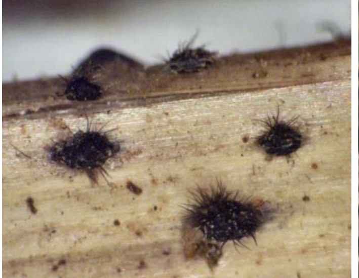
Fig 3. Pseudothecia (spore producing structures) of the fungus that causes tan spot of wheat. Spores formed in the black structures are ejected onto seedling wheat leaves.

disease in the spring because tan spot can cause more severe losses than leaf rust or powdery mildew. Septoria leaf blotch and Stagonospora glume blotch also over-summer (and over-winter) on straw residue, so occurrence of these diseases also should be monitored closely in the spring.