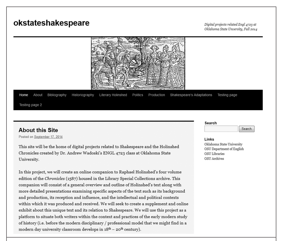
Figure 16.1. OkstateShakespeare project homepage. The image is a woodcut of Macbeth and Banquo meeting the three witches from Holinshed's Chronicles.