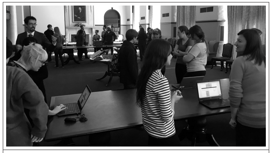
Figure 16.3. Students discussing their project webpages with faculty at the digital showcase.