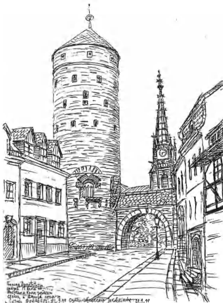
The Donatsturm, Freiberg (mid 15th century), with Town Wall and Jakobskirche in Background (Sketch by Eugeni Milanovsky)

The first thing to notice is 'East' Germany itself. It must have been badly dilapidated before the re-unification, for the contrast between those buildings restored and some of those not yet refurbished was/is truly astonishing. However, so far as Freiberg is concerned the task of reconstruction seems to be about 80% complete, and refurbishment of basic infrastructure seems to be almost finished through the parts of 'East' Germany where I travelled. I should suppose that the whole task will be completed in 5–10 years. Yet the world of the East is still quite different from that of the West. It remains very quiet everywhere: it is as if all the people are still 'asleep'. There are few folk on the streets, particularly after dark and on Sundays, when all shops are closed. But traditional courtesies are much to the fore, and it is said that there is little or no crime (at least in Freiberg). No police are to be seen, but pedestrians obey traffic signs, etc. , religiously. The food is excellent, and the prices moderate. I should like to live in Freiberg—a beautiful mediaeval town emerging as a wonderful place after years of neglect.