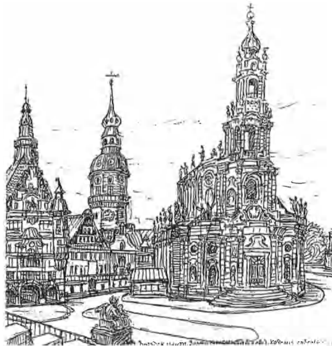
Dresden: Catholic Cathedral and Kurfürst Castle (left)

A visit to Dresden was also memorable. The recent reconstructions there have been truly remarkable, and the city is well set to be, once again, one of the great tourist attractions of Europe. Many wonderful buildings are to be seen, but we spent time chiefly at the magnificent 'Zwinger' palace and the royal treasury. We were privileged to have a private viewing of the extraordinary jewellery collection of 'Augustus the Strong' in the 'Green Vault' treasury—Saxony's response to the world of Louis XIV. The miraculous workmanship of the court jeweller Dinglinger had to be seen to be believed. Whether it is right that such wealth (derived from the silver that the Freiberg foundry had to sell exclusively to the Elector's administration) should exist anywhere is doubtful—but it has its modern counterparts in the likes of Bill Gates, I suppose. There is a notable mineral collection in Dresden too, which city sought to rival Freiberg in matters mineralogical, but unfortunately it was not available for inspection on the day of our visit.