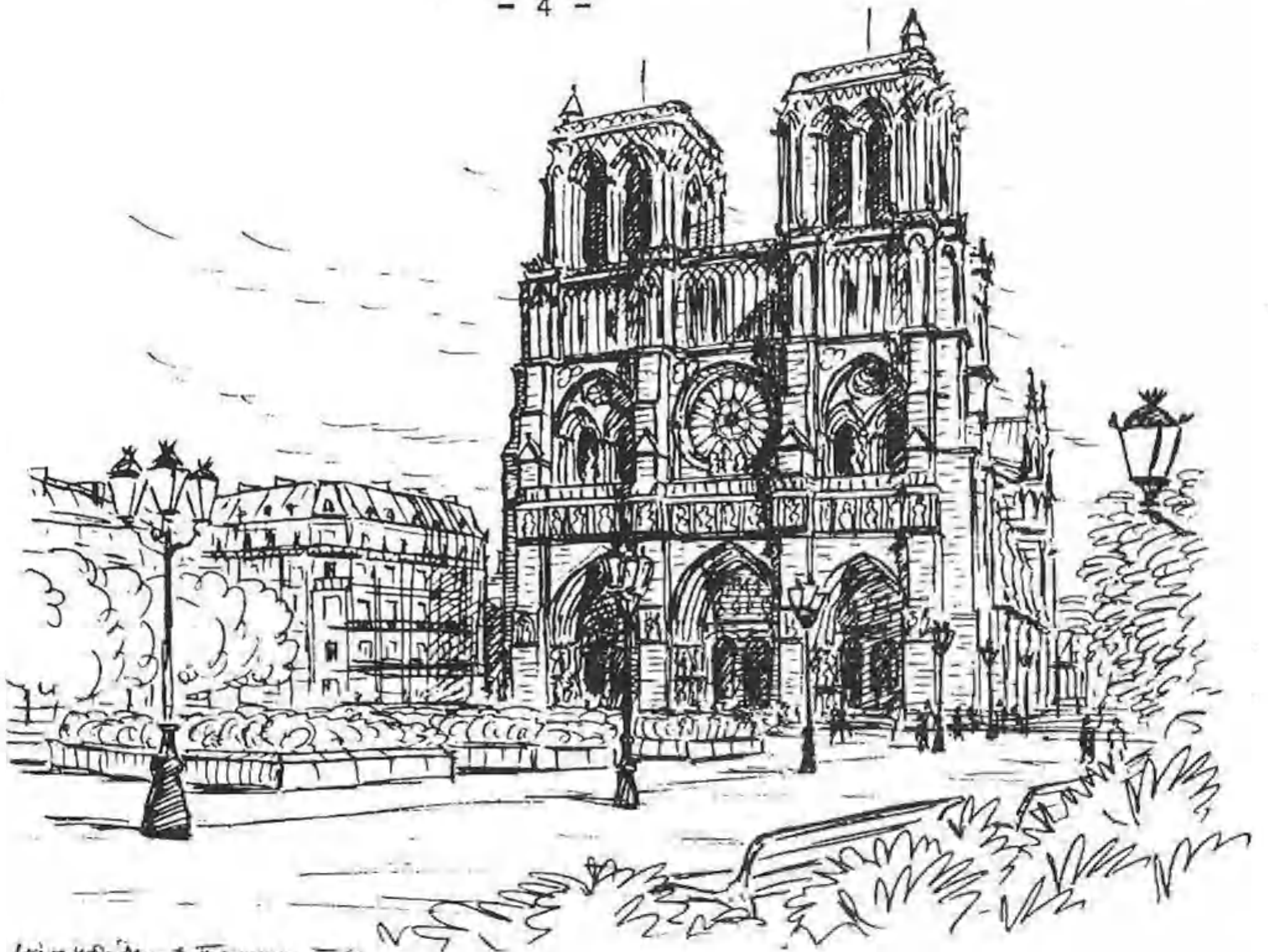
Notre Dame